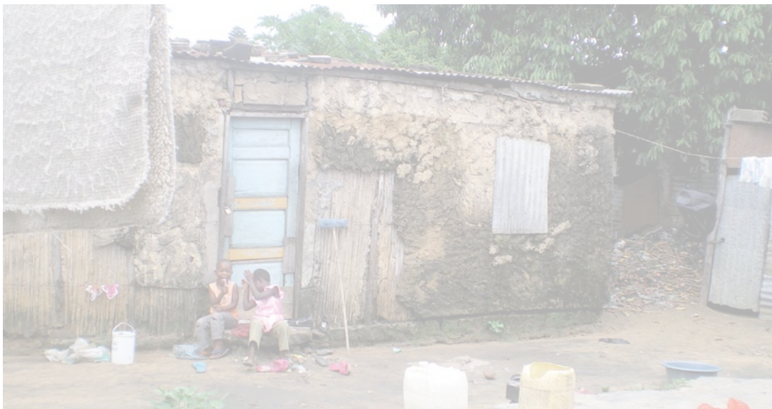
Two children play around a household in Chamanculo C, Maputo