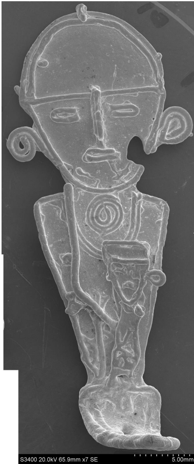
Figure S12. SEM composite view of tunjo O33296 from Suba.