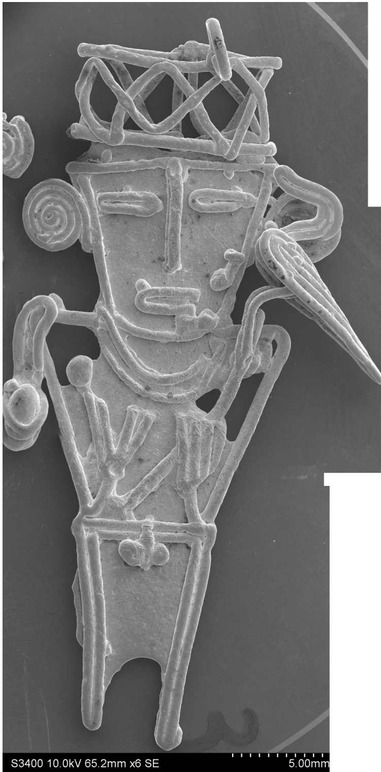
Figure S13. SEM composite view of tunjo O33297 from Suba.