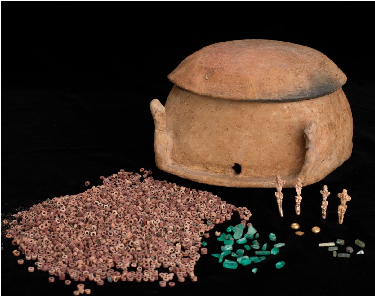
Figure S5. General view of the Tocancipá offering, including the ceramic offering vessel, stone beads, emerald and glass fragments, tunjos , tejuelos and gold nuggets.