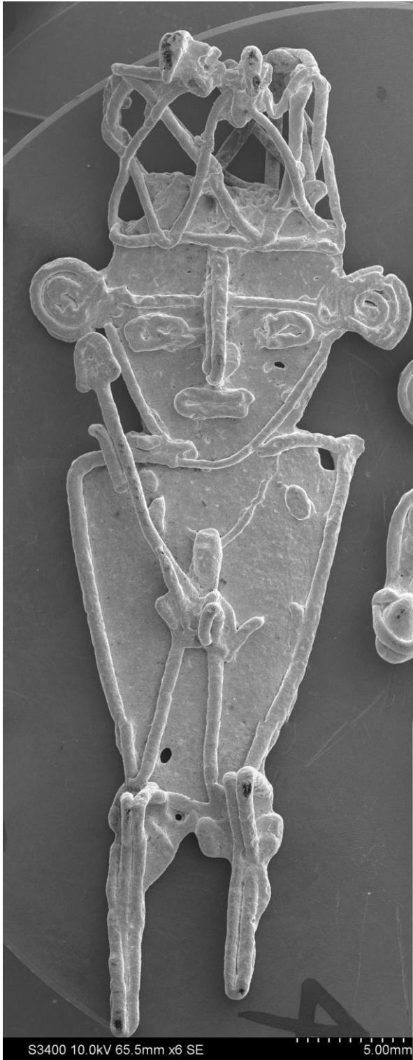
Figure S10. SEM composite view of tunjo O33292 from Suba.