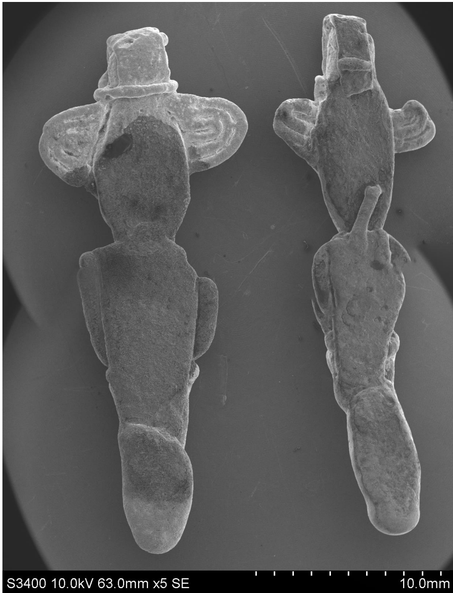
Figure S6. a) SEM composite view of the front (a) and back (b) of two of the tunjos from Tocancipá (from the left, O33894 and O33895).