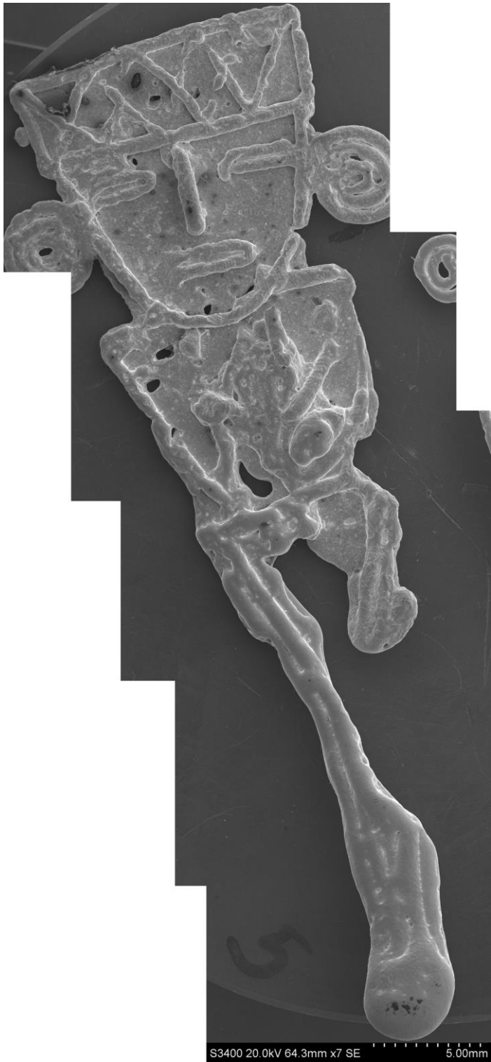
Figure S11. SEM composite view of tunjo O33293 from Suba.