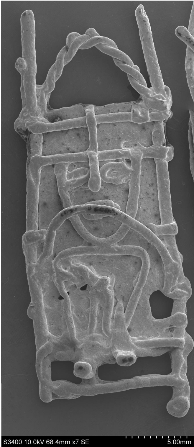
Figure S14. SEM composite view of tunjo O33302 from Suba.