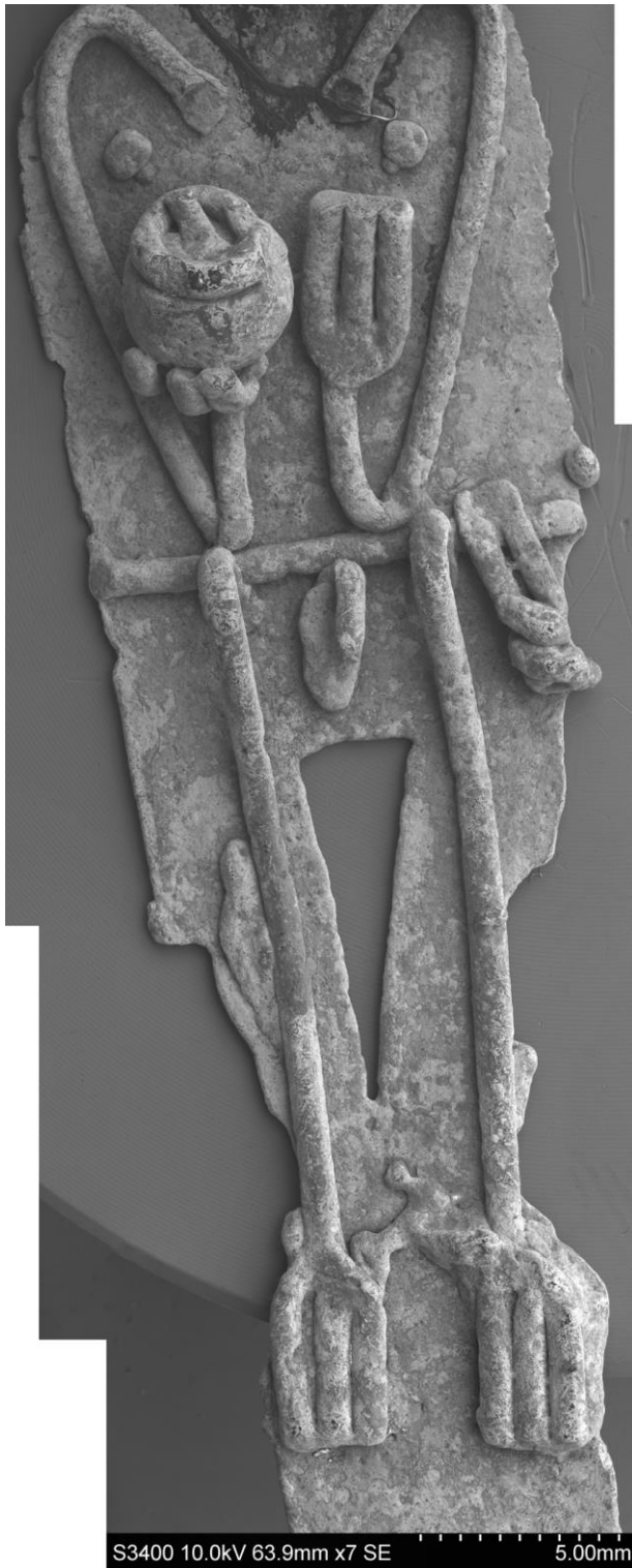
Figure S9. SEM composite view of the body of tunjo O33811 from Tenjo.