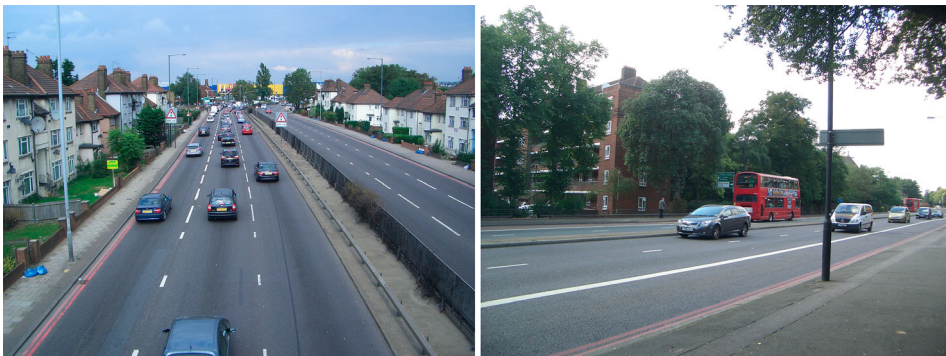
Figure 2. Static and dynamic severance.

Transport infrastructure and road traffic may be physical barriers even when crossing facilities are provided. Poorly designed or maintained facilities may