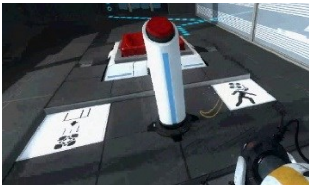
Figure 4: Screenshot of floor symbols in Portal 2

Portal 2 contains many hints in the environment. For instance, in Figure 4, the symbols on the ground indicate that the button will release a cube from the ceiling but that the player should watch their head! However, players rarely seemed to refer to these pictorial clues, and it is not clear whether they actually paid attention to them or not. Arguably, these hints would be easier to interpret only after having had some experience of playing the game.