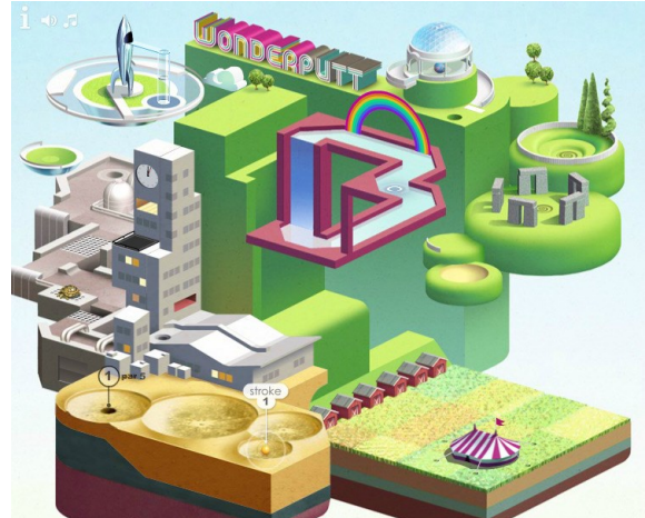
Figure 1: Screen shot from Wonderputt (2012 finalist)

Materials: Each participant played two games of different genre, to improve the generalizability of the research. Both games were sourced from Independent Games Festival finalists [13] to ensure they had a reasonable level of quality and that, being independent games, it was unlikely that participants would have played them before.