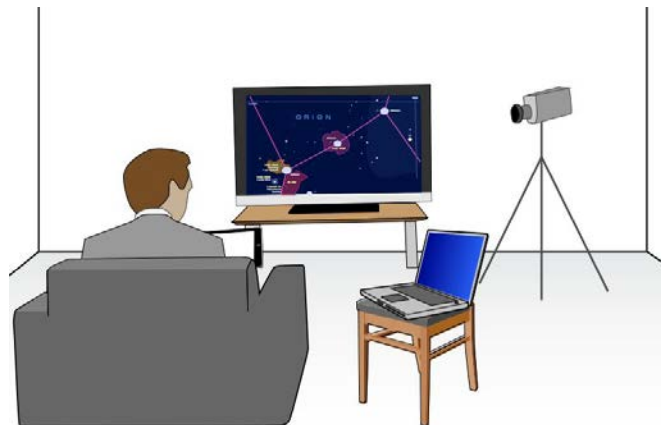
Figure 3. Participants viewed CompanionMap on a tablet they were holding while watching the television programme on a large screen. The laptop to one side displayed the probe questions after each episode and logged participants' responses.

Experiment 1 used a one-way repeated measures design comparing Condition (watching the TV programme with and without CompanionMap). Each participant viewed both programme episodes, one with CompanionMap; the order of the episodes and the use of CompanionMap was counter-balanced in a latin square of four groups to avoid learning effects. The probe questions were administered both before and after watching the programme episodes. Experiment 2 also used a one-way repeated measures design comparing the use of the interactive version of CompanionMap with the base version. The experimental design was identical to the first experiment except for Condition (non-interactive and interactive CompanionMap). All dependent variables were identical.