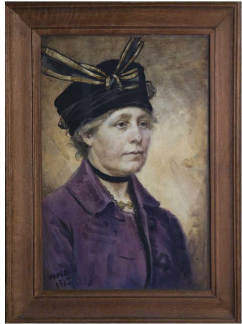
Fig. 3: Water-colour portrait of Margaret Murray by her former student, Winifred Brunton; it is dated 1917, when Murray would have been 53 or 54.

Within the College too, her imprint has, not surprisingly, faded. During the desegregation of the senior common rooms in 1969, the for-