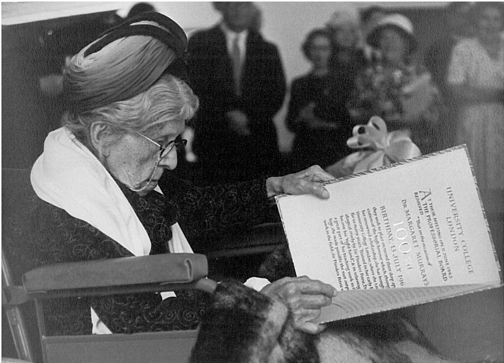
Fig. 1: Margaret Murray on the occasion of her 100th birthday which was marked by the presentation of an address from the Professorial Board.

while Petrie was away excavating in Egypt. She should, however, be judged as the independent scholar she undoubtedly was, who conducted her own excavations in Malta, Menorca and Palestine, and published a long list of scholarly articles and books on Egyptology and other archaeological subjects.