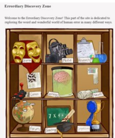
Figure 1: Errorriary discovery zone website

The CHI+MED project investigates ways to improve safety within healthcare. In this context, we have been exploring different mediums for public engagement e.g. social media, games. Errorriary, a twitter hashtag for sharing day-to-day errors, has grown to become a public engagement portal for human error and related topics. As an interactive way to raise awareness of human error research within the context of healthcare, we held a game design competition for the Errorriary website (Figure 1). Teams of students were challenged to develop a game that inspired curiosity and reflection on human error and blame culture e.g. that got players thinking about how individuals can get blamed when the wider system is at fault.