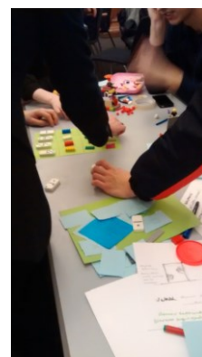
Figure 2: Game design workshop

In order to facilitate the engagement of teams and ensure the games reflected appropriate understandings of the competition themes, we adopted a format that was influenced by participatory approaches to design. The competition started with a kick-off event where experts presented on human error, blame culture, health care and game design. This was followed by a Q&A session and a game design workshop (Figure 2). The event emphasis was on bringing designers together with domain experts to ensure that students would be given relevant information from research and practice for their games. Kelty et al., (2014) argue that one of the key dimensions of participation is the “educative dividend that might result” (p. 7). We wanted our participants to learn, not only about the competition topics, but also about user-centred design approaches, working in teams and developing games for serious purposes. The experts also learnt from taking part, particularly in relation to the topics they were less aware of and from discussing potential game ideas.