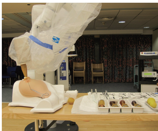
Figure 1 Simulator for training in the TARGIT Academy. The Intrabeam with applicator has been placed into the tumour bed of the simulator, and a purse-stitch applied. TARGIT, targeted intra-operative radiotherapy.

medical physicists and other members of the multidisciplinary team. As the success of this technique depends on multidisciplinary team working harmoniously with each other, the training is available only to teams and not individuals. At the outset it was felt important that the entire team should listen to some of the detailed specialist instructions so that they can appreciate the roles of their colleagues more fully. For example, many of the surgeons will be unfamiliar in the use and handling of the IORT device, selection of an appropriate applicator and adequate placement in the tumour bed; it is important that the entire team are aware of these “surgical” details, as they can have a bearing on other aspects of patient management.