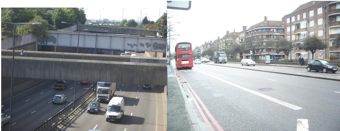
Figure 2: Static and dynamic severance

facilities to cross or walk along roads [Poole 2003]. More generally, severance depends on the pedestrian interaction with the environment and with other traffic system users [Hodgson et al. 2004].