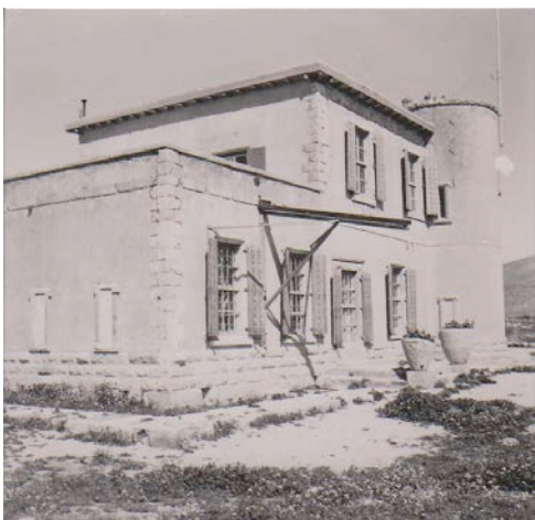
Fig. 5: A view of the front of 'Antiquity House'.

century immigrants from the Caucasus (Luke and Keith Roach 1930: 403; Thornton 2012).