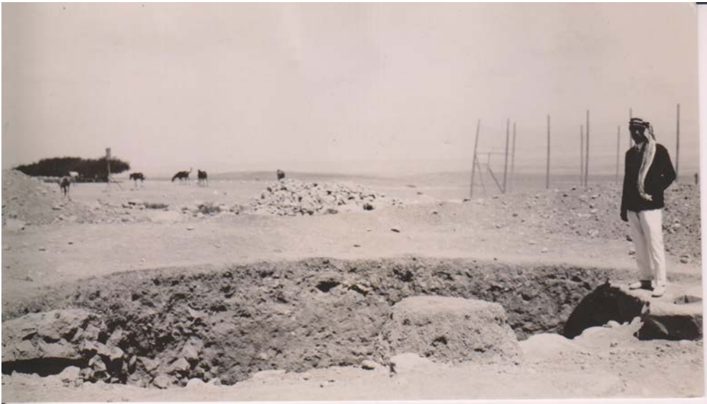
Fig. 8: A photograph in the Horsfield archive of Ali at Irbid, Transjordan.

minds and doings are all in the negative in active opposition or inverted literally the cart before the horse. They demand an elastic patience wh[ich] I have not ever on tap. I try to imagine you here wrestling with absurd problems wh[ich] never arise in a civilised place – but wh[ich] are part of the struggle to live in the East [...] The problems are so many of them infantile that I sometimes think it is mostly probably my own fault arising from a deficiency in ideas of proportion – so many things one fears to let go – for one goes + the ‘malesh’ spirit in the saddle – that is the spirit of ‘why bother?’ then comes the decline which you find amongst orientalised Europeans – who marry Levantine wives!’ (Horsfield 1931m)