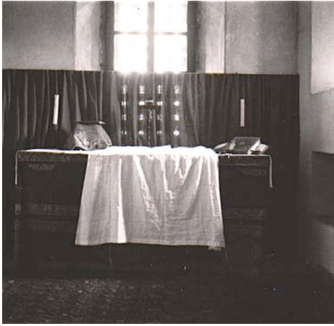
Fig. 2: The chapel inside Horsfield's house.

Architectural Record , a monthly architecture journal published in New York City with a national circulation that is still issued today. In its early 20 th century form Architectural Record combined pieces on the culture and history of architecture with descriptions and analyses of projected, on-going or recently completed building projects (Lichtenstein 1990: 17–35; Thornton 2011b). Horsfield's covers and article focus on Liverpool's Anglican Cathedral, then being constructed to Giles Gilbert Scott's design.