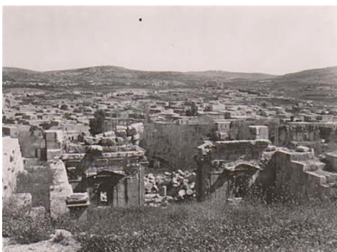
Fig. 4: A detail from a contact print in the Horsfield archive showing a view through the Propylea of Artemis with Jerash village beyond.