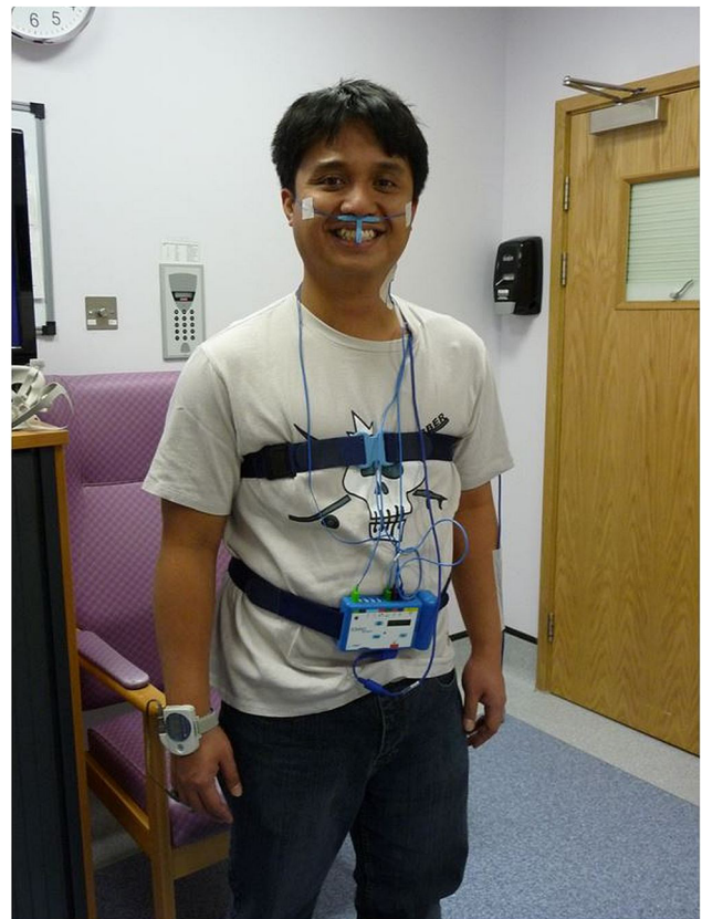
Figure 1 (A) wearable apnoea detection device (WADD) worn by one of the investigators. (B) Participant wearing an existing state of the art ambulatory apnoea monitoring system (SOMNO), comprising finger oximetry; oronasal flow sensors; thoracic and abdominal expansion bands; and ECG.