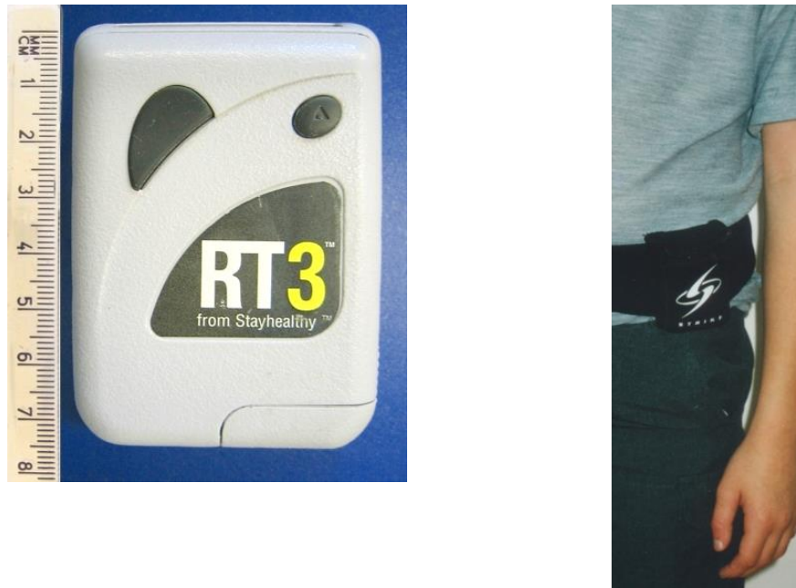
Figure 1 The RT3 motion sensor

The other main strand of the project forming the basis of this paper is the assessment of the travel and activity patterns using the RT3 portable motion sensors. The RT3 is a tri-axial accelerometer, manufactured by Stayhealthy, USA. It measures movement in three directions and is worn in a belt around the waist. An example is shown in Figure 1.