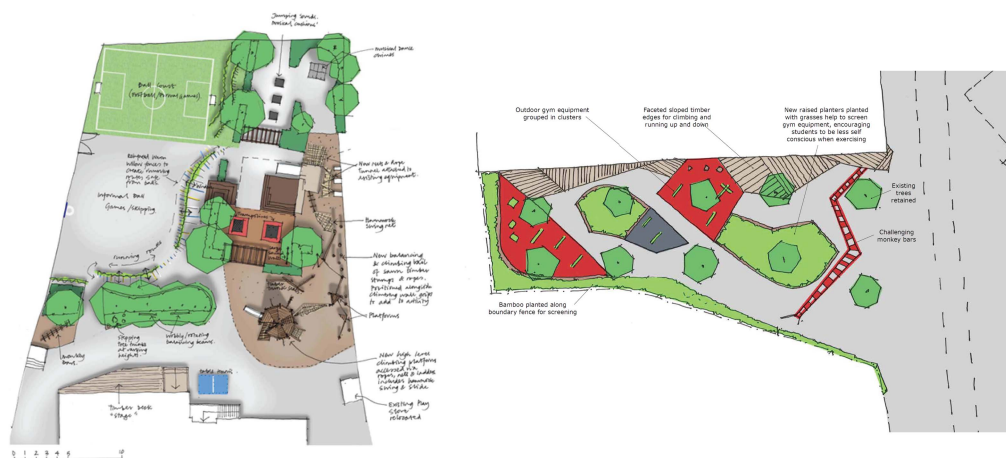
Figure 1 Example of new playground designs.

term of 2015 (see figure 2 ). Between baseline and follow-up I (school summer holidays), the school playgrounds will be redesigned. A second follow-up will allow us to investigate if short-term effects of the intervention (if they exist) are sustained over a longer period. This evaluation has been funded by the Economic and Social Research Council, UK (ES/M003795/1), while the core project (playground redesign) has been funded by the Camden Clinical Commissioning Group and London Borough of Camden.