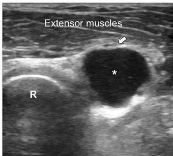
Fig. 1 US imaging (axial view) shows an anechoic (ganglion), lobulated cyst (asterisk) compressing the posterior interosseous nerve (white arrow) distal to its branching from the radial nerve at the level of the radial head (R)