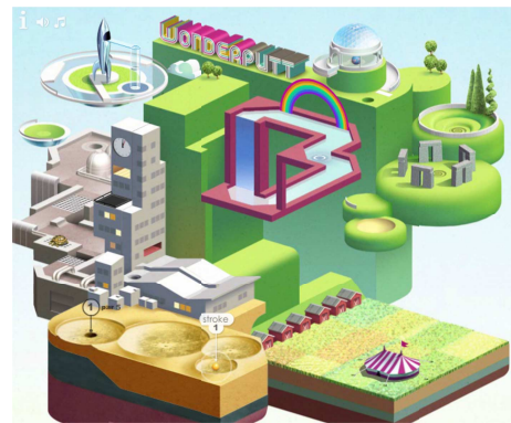
Figure 1: Screenshot from Wonderputt (2012 finalist)

This was an observational study of play that included a post-play interview (where a recording of the game-play session was reviewed).