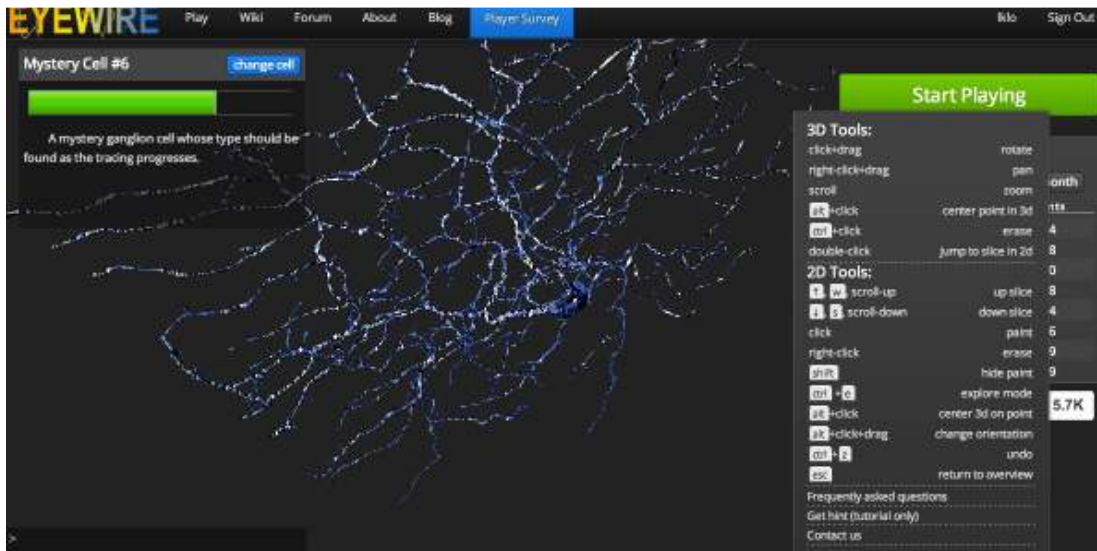
Figure 12: help summary for 3D and 2D controls in Eyewire