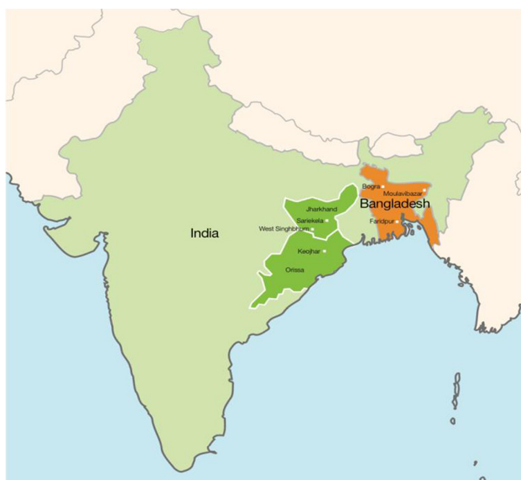
Figure 1 Map displaying the location of the different study sites.

fieldworker. Information about the individual surveillance systems can be found elsewhere [23-26].