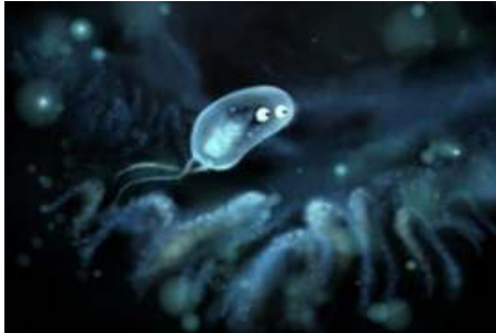
Figure 2. Synthetic Biology game © 2013 UPD

of biological devices, based on the combination of Biobricks. In the future it is hoped that advanced levels of the game could be complex enough to lead to players making new discoveries in the field of SB.