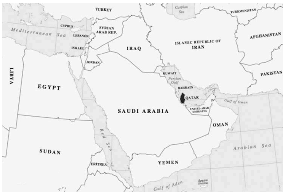
Figure 1 Map showing the location of Qatar in the Middle East.