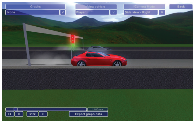
Figure 1. Drag strip

the Department of Mechanical Engineering: a first year course on solid mechanics (average age 19, 143 males and 15 females) and a final year course on Vehicle Dynamics (average age 22, 14 males and 1 female).