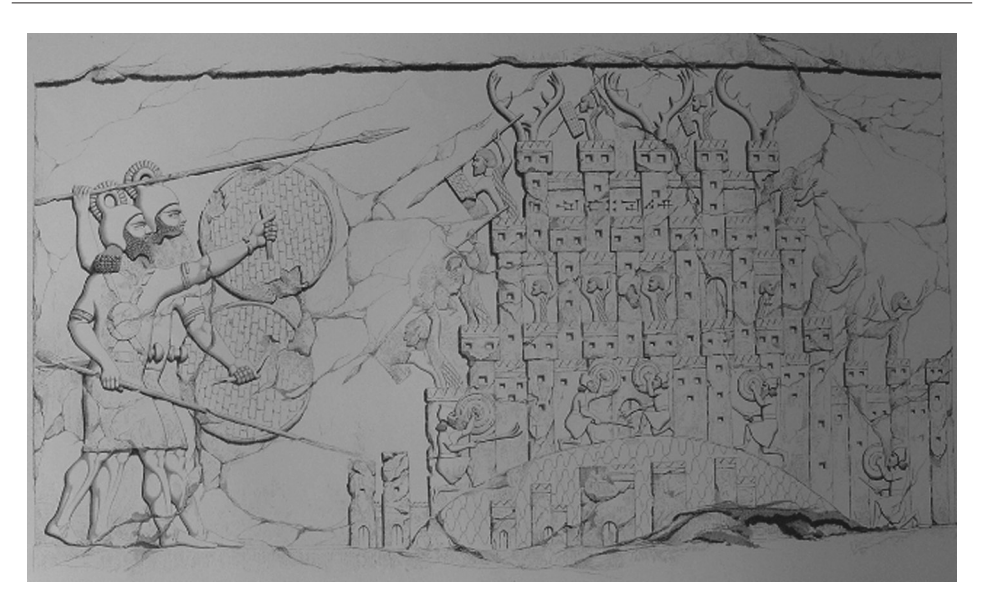
FIGURE 22.1 The Median fortress of Kišessim as depicted in Room 2 of Sargon II's palace at Dur-Šarrukin (mod. Khorsabad). Reproduced from P.-E. Botta and P. Flandin, Monument de Ninive , vol. 1, Paris, 1849, pl. 68bis.