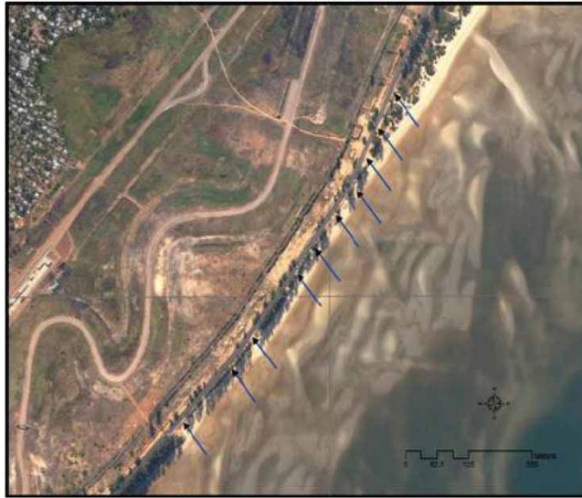
Figure 3. Points of Marginal Avenue susceptible to be affected by the erosion processes linked to the sea level rise effect.