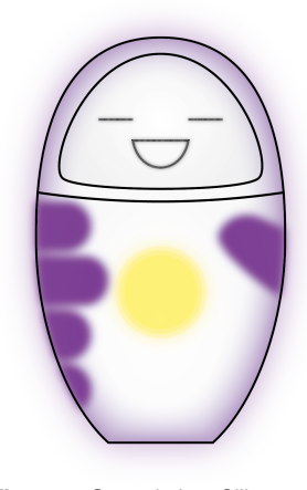
Figure 5. Our solution: Silka

The device would be constantly connected to a mobile data network and wouldn't require any set up. On sensing a touch and movement, it sends a "smile" and a "handprint" to its twin device. The colour of the print roughly represents a physical state of the sender and depends on the combination of input