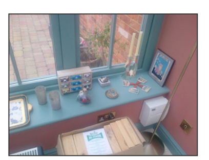
Figure 3. Meaningful objects in one of the participants' homes

The analysis of 58 survey responses and notes from five interviews revealed a number of communication patterns. To stay in touch, families living apart took advantage of the latest technologies. The frequency of communication depended on the distance and the bond, but it remained regular at a set time (usually weekly) with occasional spontaneous communication, mainly in the form of text messages. However, even though the communication was regular, feelings of loss, anxiety, and guilt were often present (see Figure 2).