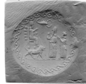
Fig. 1: The stamp seal BM 2002-05-15: 1. Fig. 2: Modern impression of the seal.