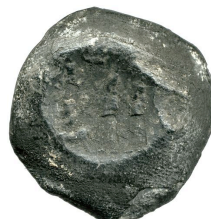
Fig. 4: Clay sealing BM 84553, with an ancient impression of the seal BM 2002-05-15, 1.