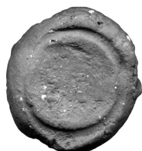
Fig. 3: Clay sealing BM 84671, with an ancient impression of the seal BM 2002-05-15, 1.

The second object bearing the impression of the chalcedony seal, BM 84553 (Fig. 4), is another uninscribed clay sealing, this time without visible string holes but instead, with impressions of a coarse textile. Due to secondary burning, the sealing is very dark in colour, which makes it difficult to see the details of the impression that, in addition, is shallower than that of BM 85671. But the king and the queen are clearly visible, as is the scorpion. The shape of the lion can be made out, albeit only vaguely, and although most of the seated goddess's body is obscured, her head is well preserved.