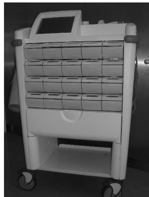
Figure A3 One of the two electronic drug trolleys. One drawer is allocated to each patient for whom medication is due and their name shown on the liquid crystal display. The barcode scanner is on the top of the trolley.