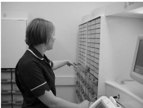
Figure A2 Nurse selecting stock medication from drawer in automated cabinet. The patient-specific drawers can be seen below the open drawer, and the screen to the right. Photo published with nurse's permission.

Medication prescribed "to be given when required" was generally given separately outside the main drug rounds.