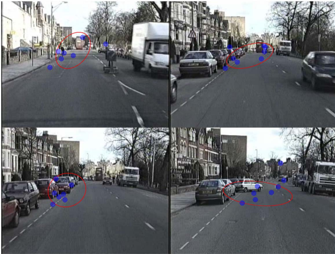
Figure 2. Novel 'Point of Regard' Analysis. Examples of the BCE 'point of regard' analysis superimposed on frames from some of the HPT films. The centre of the red ellipse represents the mean 'point of regard' of the controls with the spatial extent of the ellipse being one standard deviation from this centre along two principal axes, theoretically affording 'coverage' of approximately 67% of the 'point of regard' locations in a given frame. Note how the location and spatial extent of this ellipse changes with each frame of the film as the control subjects' view is drawn to different aspects of the changing road scene. For each frame the number of patients' points of regard (blue symbols) 'captured' by the ellipse can be automatically counted and compared to the expected value under the null hypothesis that the average 'viewing area' is the same in the two groups. Note that not all nine patients are recorded in each frame because of blinks, loss of data, and variable responses. Also, note that in the UK vehicles are driven on the left hand side of the road. See Audio/Video - S1. doi:10.1371/journal.pone.0009710.g002

more saccades to search the image as a 'compensation' for their restricted field of view. Since a binocular visual field defect reduces the amount of visual information available, this might suggest fewer eye movements [32], but this was not the case when patients were viewing these moving images. Our results also indicate that fixation duration was, on average, shorter with patients compared to controls. In contrast, it has been previously shown that fixation duration increases with the size of absolute central scotomas, but this was in a study using artificial scotomas on healthy subjects and a different task (searching a static image) [32]. Others have shown a reduction in fixation duration when an artificial scotoma is used to block foveal vision. [33]