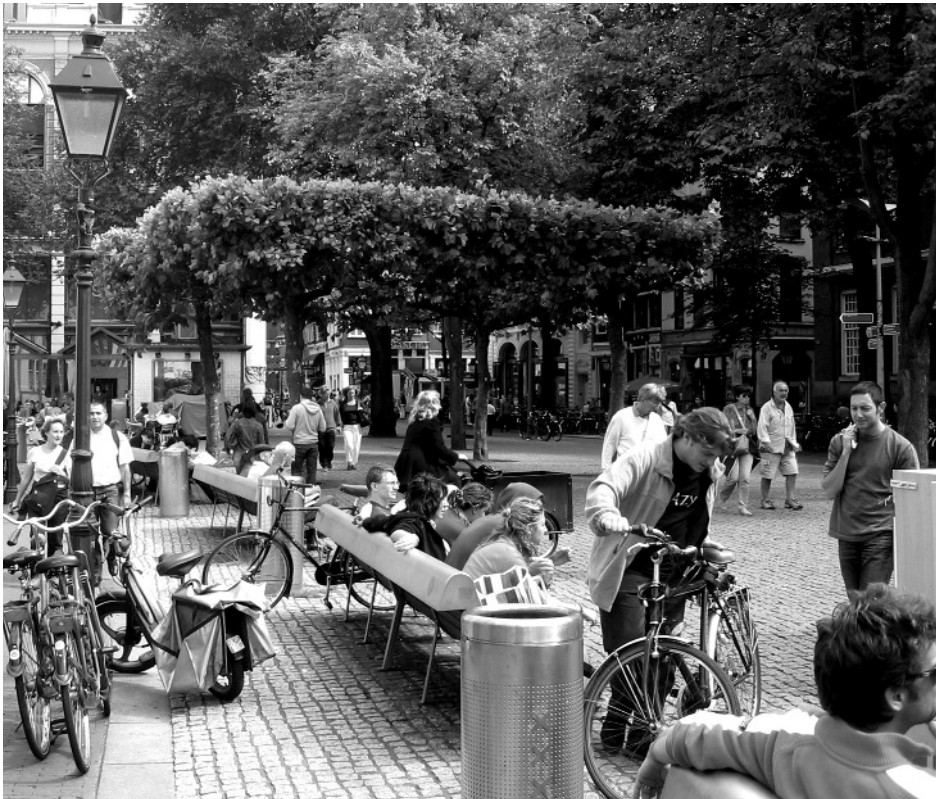
We need to raise our collective game – state-of-the-art walking, cycling and public transport networks are required, integrated with a radically enhanced quality of life in urban areas

is our investment strategies now that are likely to make (or at the moment more likely not to make ) the difference in future years. We are, it seems, hopelessly complacent in accepting and perpetuating our car-dependent lifestyles. Surely we can raise our collective game?