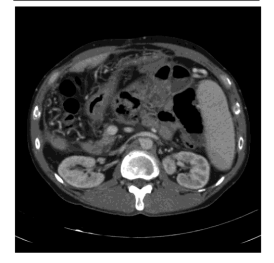
Figure 3. MRI scans showing the encapsulated bowel mass and fibrotic peritoneum