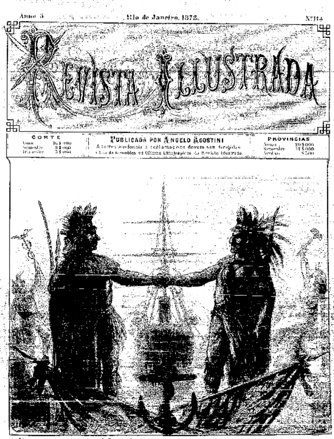
Chrauda de paquete City of Rio de Jameiro. Una novo e explendido harizonte que se abre no commercia e a Industria entre duas grando nações americanos. Jameiamos a nova compansa de paquetes americanos.

'Chegada do paquete City of Rio de Janeiro', 1 Jul. 1878, Revista Illustrada (R. Janeiro), 3:114, 1<sup>769</sup>