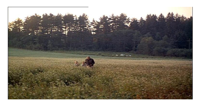
Crossing the field of life: Zerkalo (1974)

All these variations of the journey occur repeatedly on the level of discrete images and sequences in the different films. Particularly striking examples of this include the 'Russian Passion' in Andrei Rublev , the entire printing press sequence in Zerkalo , the many crossings of fields in a deliberately zigzag way: at the beginning of Zerkalo , the three monks at the beginning of Andrei Rublev ,