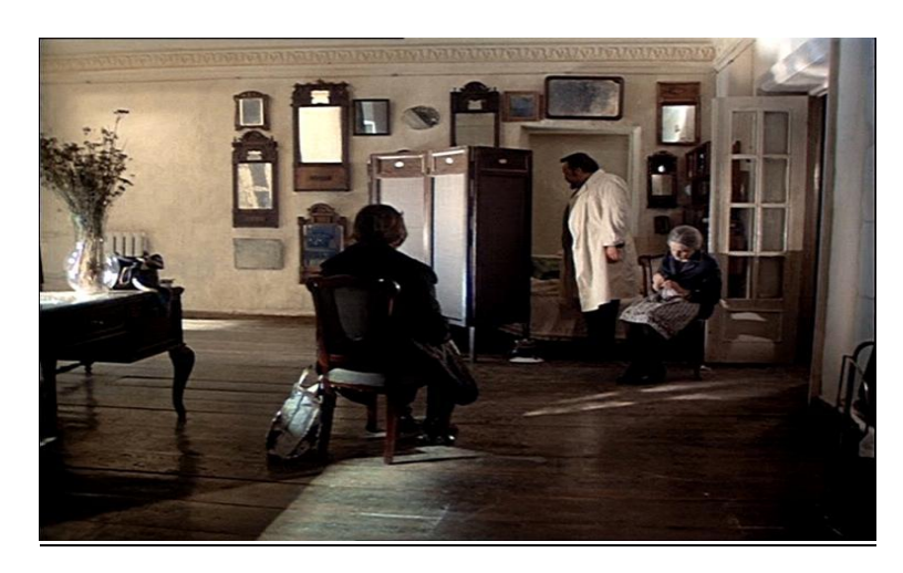
Reflections of a whole life: Zerkalo (1974)

In Zerkalo , the idea that man needs a mirror to find truth which was expressed in Soliaris becomes a metaphor for an entire film. In restricting the focus of the narrative to the life of one individual, viewed from the perspective of its endpoint at the narrator's deathbed, Zerkalo explores the idea of the tselostnost' of a life lived. The fragments of this life are portrayed as a mosaic of episodes from the different parts of the narrator's own life, documentary footage of historical events from his lifetime, and even scenes from his mother's life before his birth. The wall of mirrors above the invisible narrator's sickbed, however, suggests that multiple versions of truth could be assembled out of these shards of the mirror. Like Tarkovskii's spheres, each of which is a 'chastitsa pravdy', each reflection of the narrator's life remains partial.