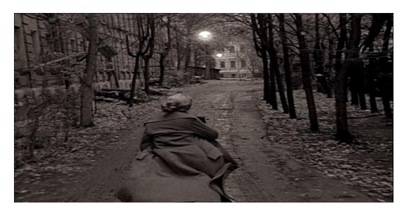
The path through the Dantean 'dark wood': Zerkalo (1974)