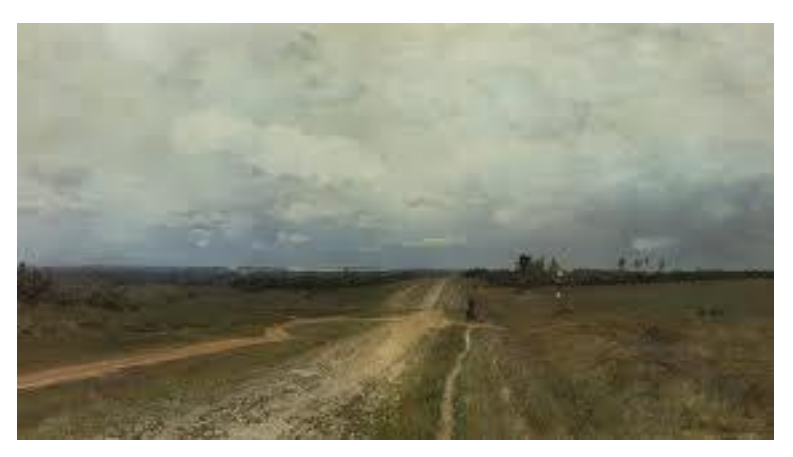
Isaak Levitan, Vladimirka (1892)

Platonov's depiction of Russia's open spaces clearly springs from a rather different sensibility. This is illuminated by a consideration of, for example, Levitan's rendering of Russia's open spaces in Vladimirka (1892), which does not 'fit' with Platonov at all.