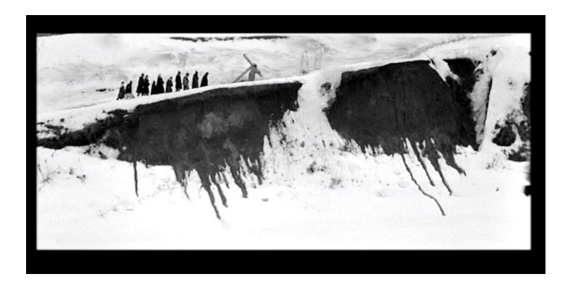
The way of the cross: Andrei Rublev (1966)