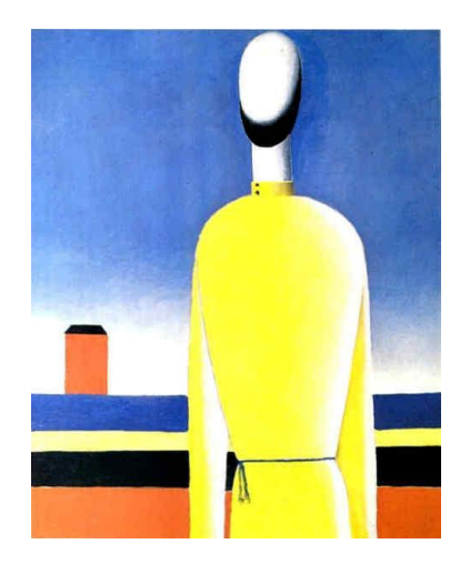
Kazimir Malevich, Slozhnoe predchuvstvie (1932)

In this connection, an intriguing resemblance can be noted between Malevich's tall, yellow-shirted figure and Shepit'ko's male peasants in Rodina elektrichestva . This is particularly true of the young engineer hero of the film who is barefoot and in a peasant tunic and appears strangely elongated in comparison to the bent villagers. In addition, Malevich's own conception of Slozhnoe predchuvstvie as composed "iz elementov oshchushcheniia pustoty, odinochestva, bezvykhodnosti zhizni" is illuminating of Platonov's vision of landscape.<sup>731</sup>