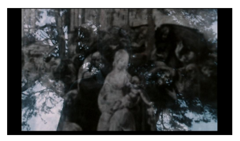
The whole world in Tarkovskii's 'dark glass': Offret (1986)

Образ — это некое уравнение, обозначающее отношение правды и истины к нашему сознанию, ограниченному эвклидовым пространством. Несмотря на то что мы не можем воспринимать мироздание в его целостности. Образ способен выразить эту целостность. <sup>539</sup>