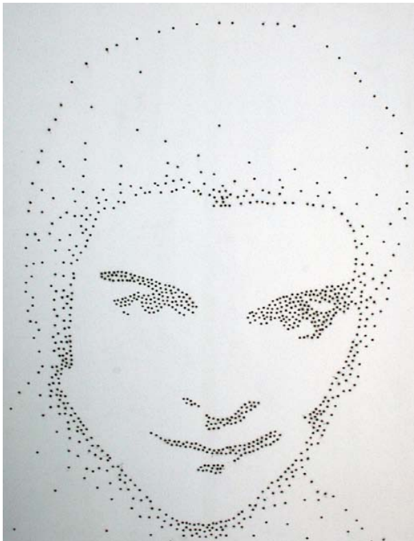
Erinç Seymen, Portrait of a Pasha , 2009 Photo: Cuneyt Cakirlar. Courtesy of galerist and the artist. Reproduced with permission.