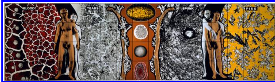
Figure 1. Gilbert and George, Blood Tears Spunk Piss, 1996.