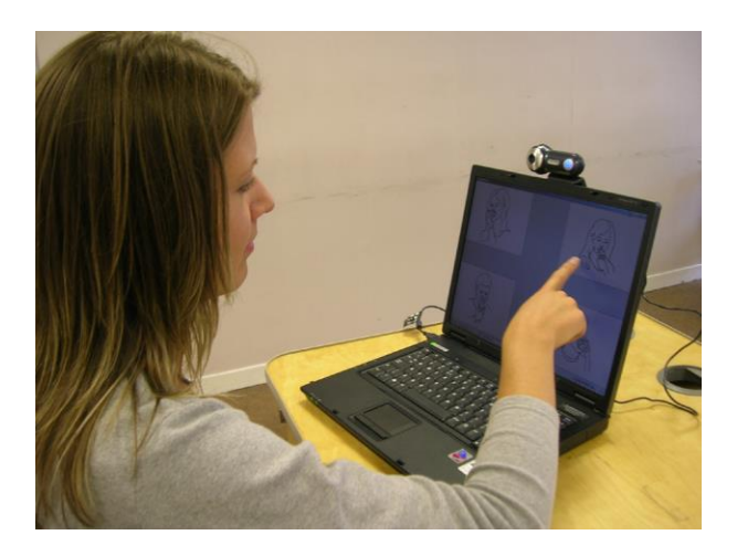
Figure 1: SP-EYE set-up

A random sequence of all items from both accent conditions was created and presented to all subjects. The set of 32 items (16 in the familiar accent; 16 in the unfamiliar accent) was presented in four blocks, each with eight trials. This gave participants a short break