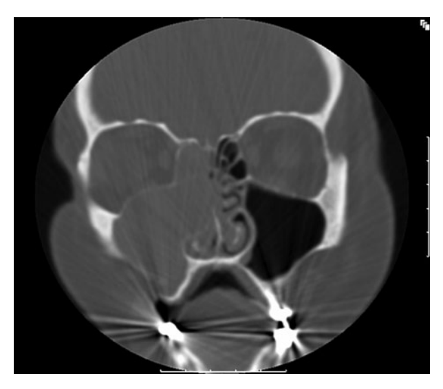
Fig. 1 Coronal computed tomography scan showing homogeneous right maxilla with elevation of orbital floor.