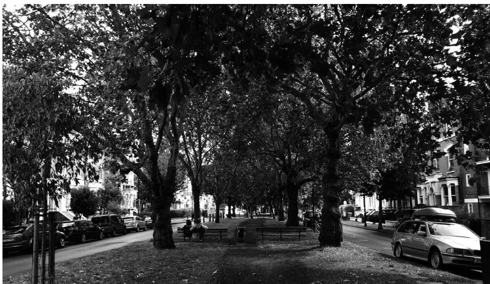
Figure 2 Petherton Green, Islington

There are things we call parks that other people would ... think of as just a patch of grass. We have a highway verge, which residents now call Petherton Green [Figure 2]. It’s basically a strip of land in the middle of a wide road. From a resident’s perspective, that’s their park. In any other borough, that’s a highway verge that you mow periodically. (PS16, council green space officer)