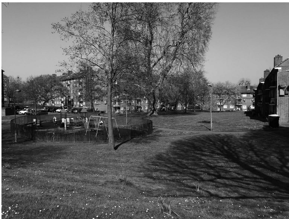
Figure 3 Ashburton Estate amenity space, Wandsworth

because perceptions of green-space accessibility remain focused on parks, the contributions that amenity spaces could make to urban sustainability are minimised.