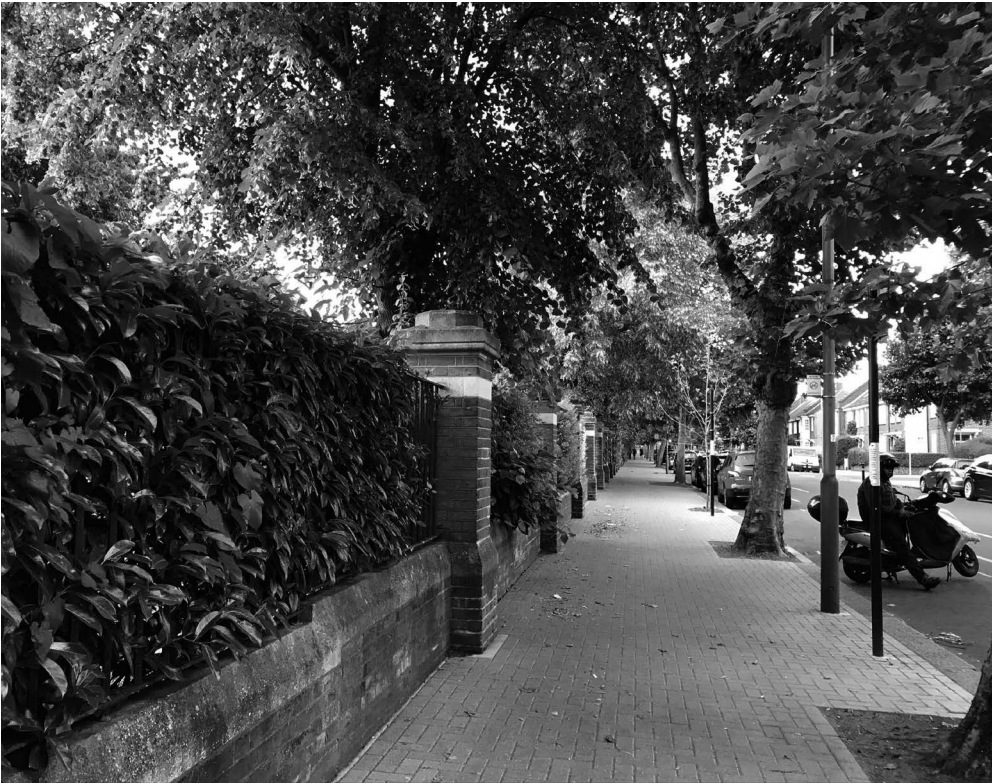
Figure 4 Vegetated fences and street trees as interconnected green infrastructure

opportunities for biodiversity, quiet reflection, shading, cooling and more that are beneficial to human and ecological health. Moreover, these elements can increase a city's greenness, including in areas deficient in access to green space and where adding new sizeable parks is unrealistic without removing buildings, which runs counter to densification policies (Norton et al., 2015). They also can serve as green links between existing traditional spaces, thus providing a greener overall experience. Planners should continue to aggressively pursue opportunities for larger parks wherever possible. London's Queen Elizabeth Olympic Park is testament to how – with political will, funding and a significant catalyst in the Olympic Games – creation of a large park is achievable. However, planners also should more readily incorporate better understanding of small-scale green interventions into decisions regarding access to green space, thus alleviating pressure on conventional parks to serve as 'sole providers of greenspace benefits' (Rupprecht et al., 2015, 216–17) in dynamic, growing contemporary cities.