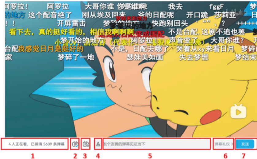
Figure 6.1 Basic danmu interface components on Bilibili.

Components 3 and 4 provide access to interfaces for customising existing danmu settings. By selecting the button marked Component 3,