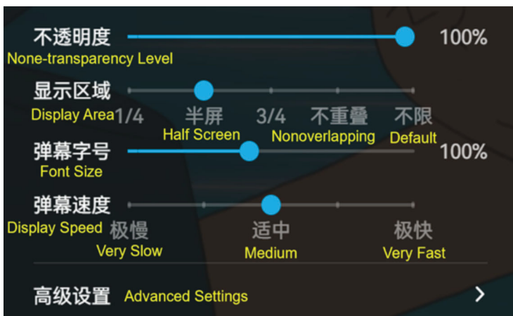
Figure 6.2 Basic danmu configuration interface on Bilibili (English translations in yellow).

users will be directed to the basic danmu configuration interface, as shown in Figure 6.2.