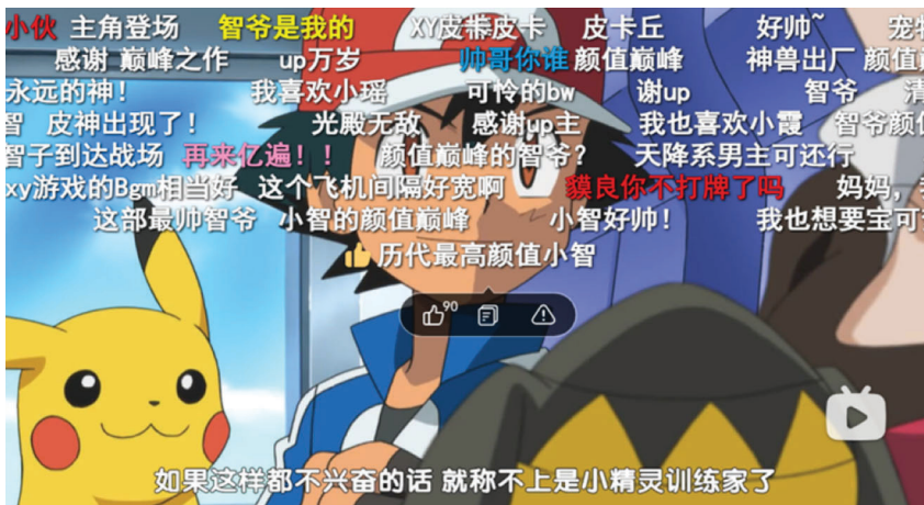
Figure 6.5 90 highly liked danmu indicated, with a yellow thumbs-up icon.