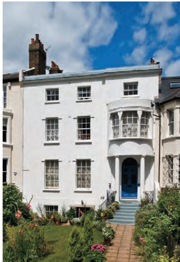
281. 60 Clapham Common North Side (formerly Maitland House), 2012