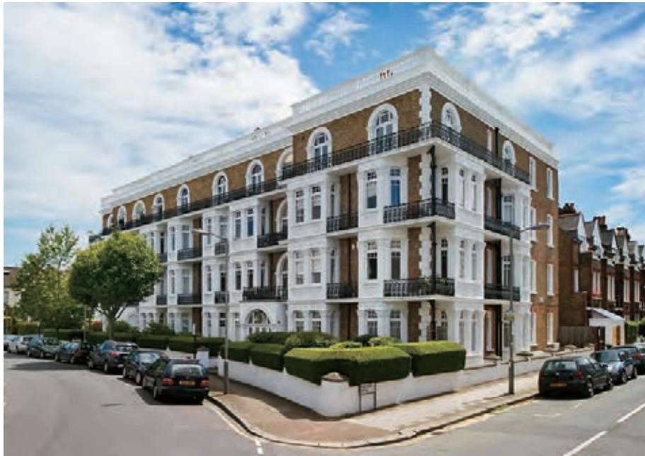
302. Avenue Mansions, Sisters Avenue, from the north-east, 2012