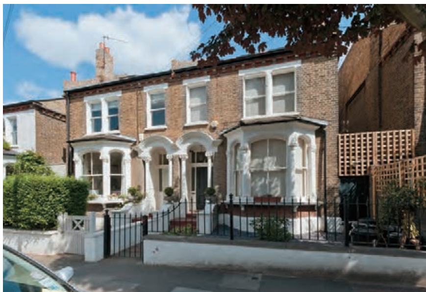
297. 6 &amp; 8 Sugden Road in 2011

not necessarily occupied as such, and as at Shaftesbury Park seem to have been built without bathrooms. One of Austin's sons, Alphonso Josiah Austin, who had followed his father into the carpentry trade, died at 8 Stormont Road in 1879, aged only 34. The congregational church later bought No. 2 and converted it to a boys' club (the Stormont Institute). This it remained until it was demolished for the new church, with the Devas Club absorbing the club's function. 88 The trio of red- and stock-brick houses adjoining to the south, at 10–14 Stormont Road, were added in 1885 by W. J. Goldsworthy, a builder of Strathblaine Road, St John's Hill. 89