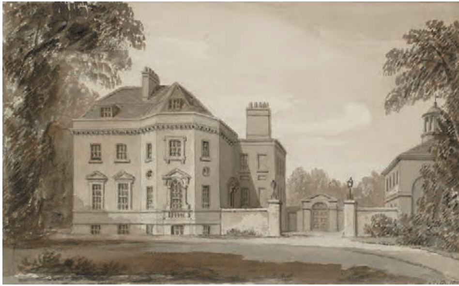
288. Sister House (latterly 82 Clapham Common North Side), main front in the early nineteenth century. Demolished