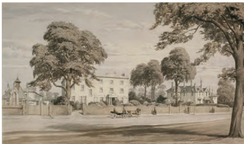
282. Northside stables, Springwell and Northside, c.1870. All demolished