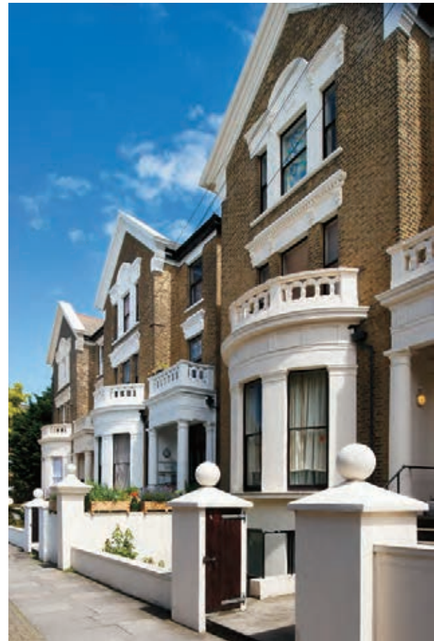
299. 1–5 Sisters Avenue in 2012. Edmund Wood, builder-developer, 1879–81

The Sisters Avenue concept was ambitious, with houses of a much wider frontage and bigger scale than was usual in Battersea at this time, fronting a road 45ft wide. It has been suggested that these aspects of the development had to some degree been dictated by Wallis, then newly ensconced at Sister House, as a way of ensuring that his new neighbours were of sufficient status. 103 Wood's houses in particular, with their basement areas, Tuscan entrance porches and stuccoed classical details – which include Wood's own monogram above the top-floor windows in the tall gables – have more in common with big west London town mansions of the 1860s than South London