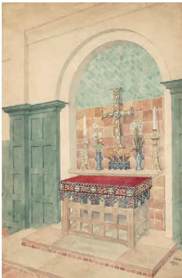
291. Gilmore House Chapel. This unattributed design for the east end, dated February 1897, is close to the final scheme. The altar table lacks the fretwork panels of the finished piece, while the superfrontal also differs from that made