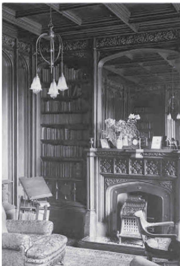
279. 58 Clapham Common North Side, Byram House, the library, c.1930

A lengthy schedule of fittings from Myers's time, and later photographs, offer a detailed portrait of a Clapham Common villa at this time. The two upper floors contained seven bedrooms and a dressing room. Generous basement facilities included a large kitchen, scullery, cellars, 'Gentleman's Room' and a separate footman's pantry. The principal floor had a French Louis Quinze front drawing room, rear dining room and an Elizabethan-style panelled library, with a matching stone fireplace (Ill. 279). As well as the stable and coach-house there were conservatories, greenhouses, forcing houses, a dairy and a gardener's cottage in the grounds. During Myers's residence the house was known as Byram (sometimes Byrom) House; he was followed there in 1882 by Edward Webb, a City wine merchant.