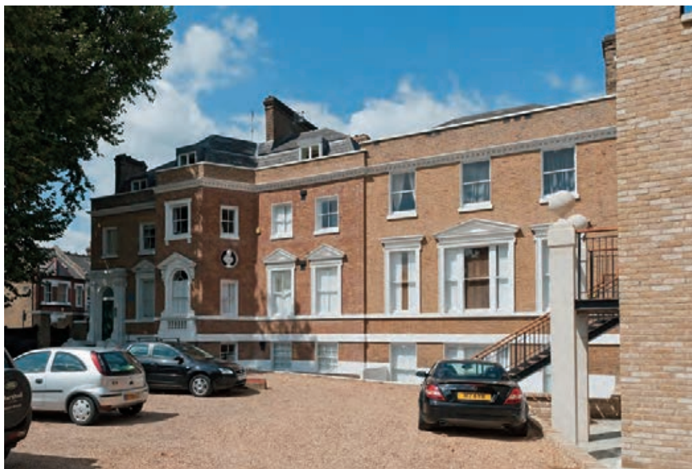
289. Gilmore House, south front in 2012