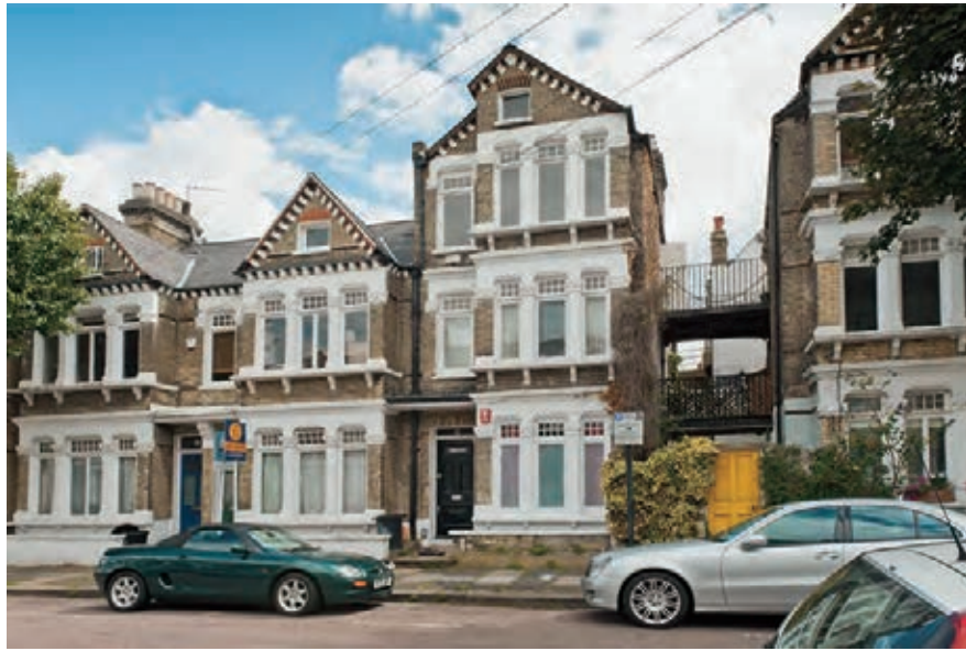
298. Flats at 20–26 Longbeach Road in 2011

many of these properties were being rented in floors as flats. J. E. Grey was also the builder of the distinctive row of tall gault-brick dwellings on the site of the old house at 99–104 Clapham Common North Side , of 1888. 95