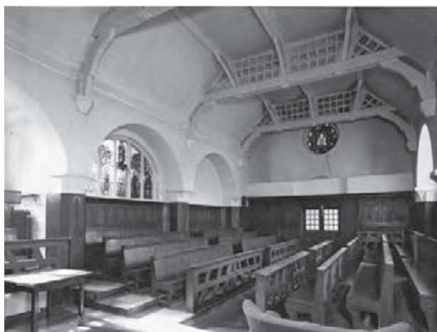
292. Gilmore House Chapel interior in 1972, looking west

were two chambers: an upper one forming the chapel itself, and a lower one comprising cellars, scullery and heating chamber. Passageways linked the building to the house, where Webb also made several improvements, reconfiguring an adjoining scullery and dairy.