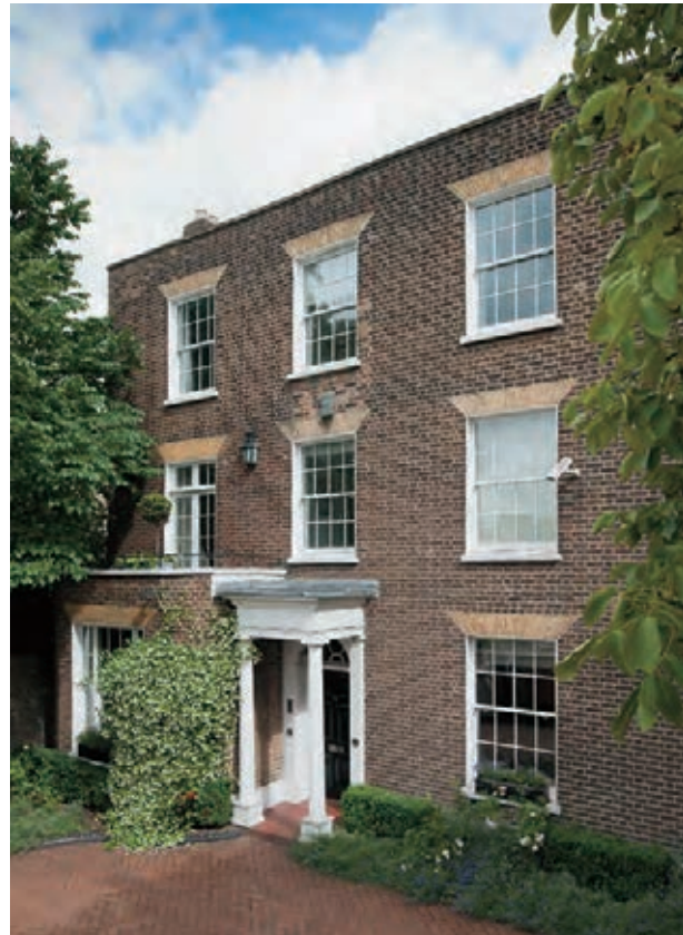
285. 81 Clapham Common North Side in 2012

No. 81, a double-fronted stock-brick house adjoining to the west, is of less certain date (Ill. 285). Stylistically, it