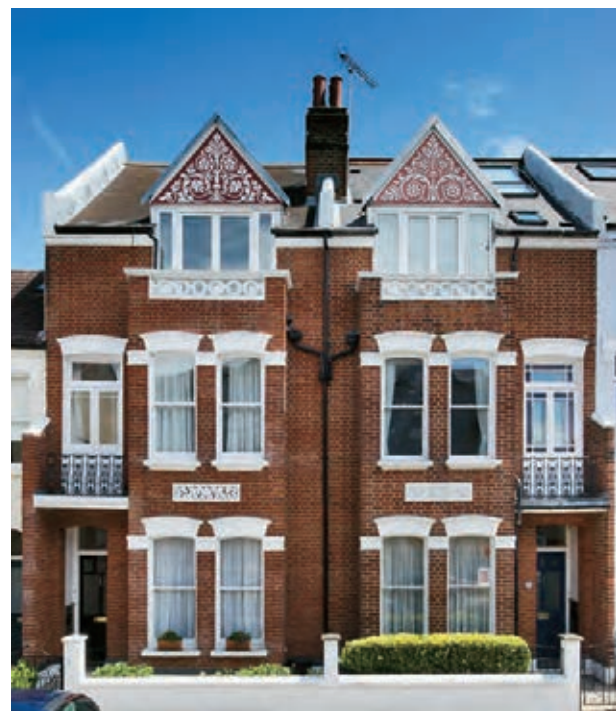
300. 22 & 24 Marjorie Grove in 2012

Flats also featured prominently. Avenue Mansions , another work of 1895 by Alfred Coomber, dominate the frontage between Sisters Avenue and Marjorie Grove. These were planned as two discrete but adjoining blocks, each containing eight flats. The stock-brick exterior is enlivened by good-quality ironwork and plentiful stucco ornament, on the balustraded parapet, window surrounds, and especially in the playful decorations to the tiers of square bay windows (Ill. 302). 110