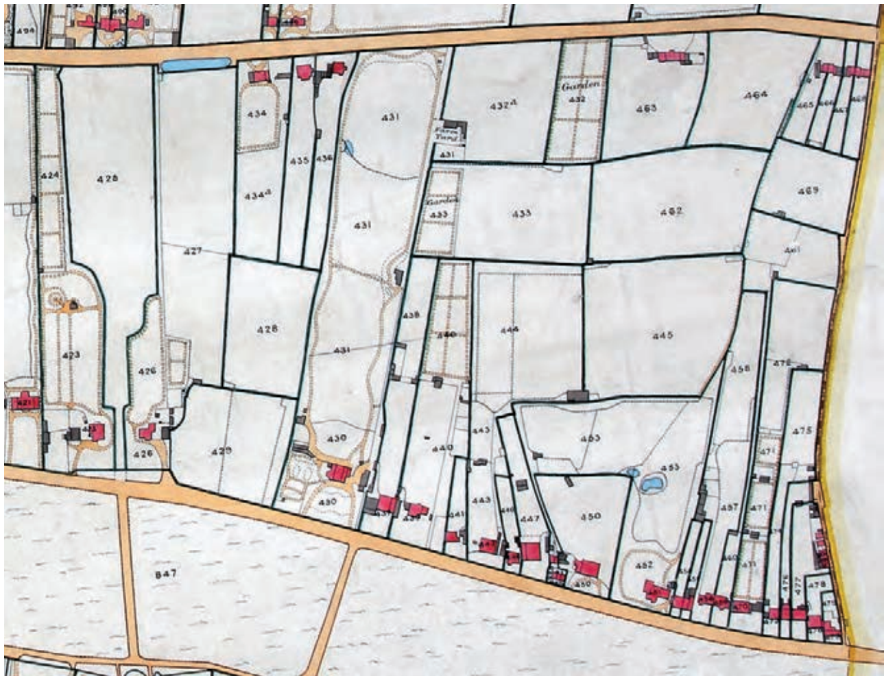
277. Clapham Common North Side villas and their grounds, c.1838.

Key Clapham Common North Side (left to right): 423–5 The Sisters (now Gilmore House), 426–9 Sister House, 430–3 The Hall (later Mayfield), 437–8 The Eukestons, 439–40 Kirkdale, 441 Brewster Lodge, 442–5 Northfields, 446 Springwell Cottage, 447 Springwell House, 450 Springwell, 451–3 Northside, 454–5 The Grahams (now 62 & 63 Clapham Common North Side), 456–8 Bell House, 459–61 Maitland House, 470–2 Byram House (now Eaton House School, 58 Clapham Common North Side), 473–7 The Limes, 478 Stonely Villa, 479 Wix's house/Cedars Cottage.