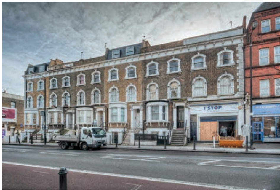
294. 73–83 Lavender Hill (formerly Rush Hill Terrace) in 2012