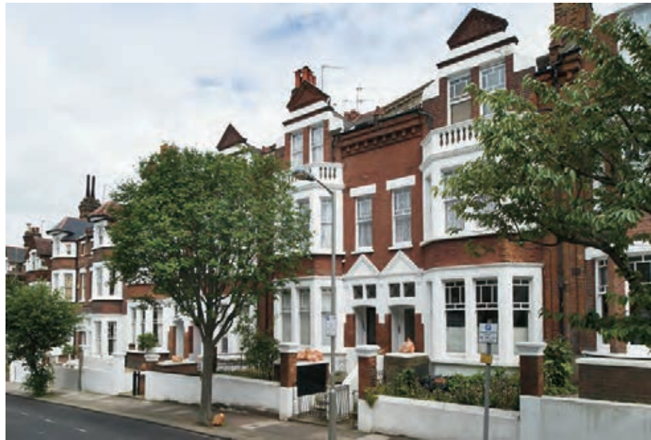
293. Garfield Road, west side in 2012