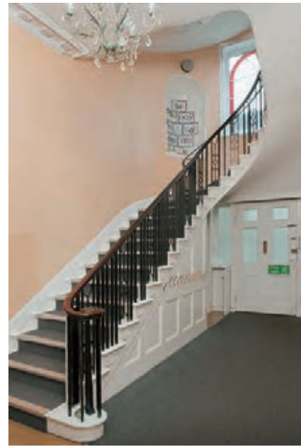
283, 284. 80 Clapham Common North Side, Parkgate House School (formerly Springwell House), main front and staircase in 2012

rear were a library and dining room, and upstairs were four main bedchambers. The curved stairwell, with statuary niches, and an elegant scrolled iron balustrade are among several surviving original features (Ill. 284). As well as a detached stable and coach-house, the house also had large grounds, with a greenhouse, vinery, and flower and kitchen gardens. 24