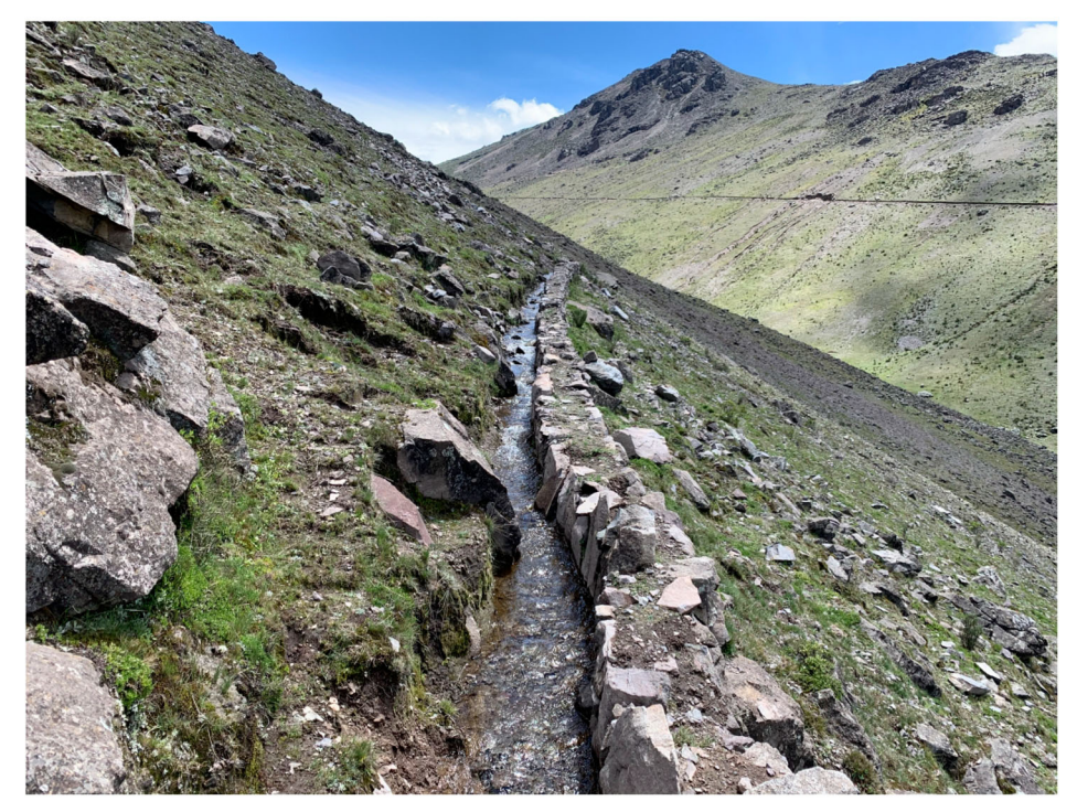
Figure 2. A restored amuna .

emerging from the city. San Pedro de Casta is a village of 928 inhabitants (INEI, 2018) in the Santa Eulalia River's upper catchment, the primary water source for the Rímac River (Figure 3). Its community depends mainly on small-holder farming and cattle-rearing for daily subsistence and income.