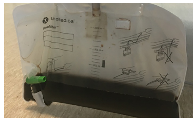
Figure 3. Urometer from a case of autochthonous human Babesia divergens infection, England. Black urine can be noted in the collection bag.

Clinical laboratories diagnose B. divergens via blood film identification and PCR confirmation