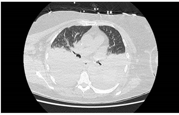
Figure 2. Axial computed tomography image from a case of autochthonous human Babesia divergens infection, England. Image shows bilateral pleural effusions.

mild bovine cases, babesiosis (also called Redwater fever) causes fever and anorexia; severe cases result in fatal hemolytic anemia with hemoglobinuria. This case documents emergence of autochthonous human babesiosis in England. Public health conducted a tick survey in the patient's local area but found no ticks carrying Babesia spp. (10). Serologic surveys were not possible because B. divergens serology is unavailable in the United Kingdom; whether subclinical human B. divergens infections occurred in the locality at the time is unknown, but clinicians and veterinarians in England were notified of the case to raise awareness.