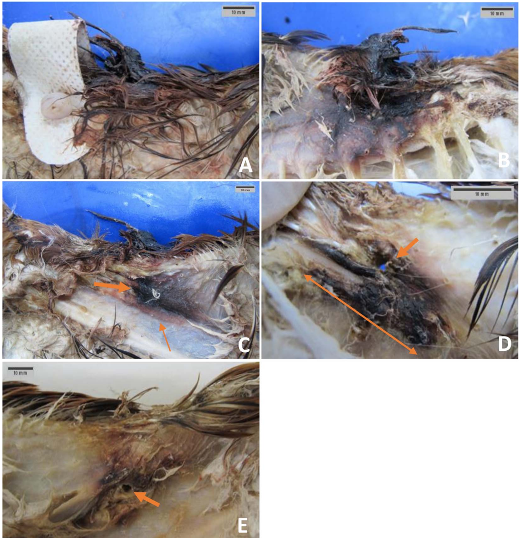
FIGURE 4. Red kite 2 ( Milvus milvus ) found at Harewood, near Leeds, Yorkshire, UK, February 2003. (A) Ventral view of the leading edge of the right patagium on the right wing. On the left, the white textile of the tag secured on the wing by the plastic rivet; centrally, an accumulation of dried blood overlying the apparent recent skin laceration. (B) Site of the laceration on the leading edge of the patagium on the dorsal aspect of the right wing after removal of the patagial wing tag and plucking of the feathers. Centrally, an accumulation of dried blood. (C) Focal dark-black skin lesion, suspected subcutaneous hemorrhage (thick arrow) and reddening skin (thin arrow) on the ventral aspect of the patagium of the right wing. The wing tag was displaced laterally on the left of the picture and the feathers plucked. (D) Locally extensive firm black skin lesion (double arrow) below the piercing hole (single arrow) of the patagial wing tag, dorsally on the left wing. The tag was removed and the feathers plucked. (E) Locally extensive skin lesion around the piercing hole (arrow) of the patagial wing tag, ventrally on the left wing. The tag was removed and the feathers plucked.

apparently chronic lesion associated with the patagial tag, but it was not known if the pre-existing lesion increased the susceptibility of the Red Kite to develop the laceration.