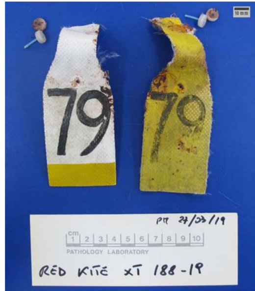
FIGURE 2. Patagial wing tags removed from left wing (white) and right wing (yellow) of a Red Kite ( Milvus milvus ) designated Red Kite 1, found in Deene, Northamptonshire, UK, September 2018.

Red Kite 1, which had been tagged as a fledgling in 2004, was found dead on a footpath on 31 August 2018 in Deene, Northamptonshire, received at IoZ on 11 September 2018, and immediately frozen at -20\text{ C} until examination on 13 September 2018. This adult female was carrying a patagial tag on each wing (Fig. 2). The carcass weighed 918.6 g (adult female range 800–1,300 g; Snow et al. 1998) and was deemed