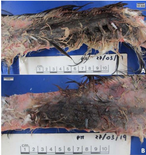
FIGURE 3. Red Kite 1 ( Milvus milvus ) found in Deene, Northamptonshire, UK, September 2018. (A) Dorsal view of the right wing showing poorly demarcated and friable skin lesions under the patagial wing tag, extending from the distal third of the radius-ulna to the carpal joint on the dorsal aspect of the right wing. The tag was removed from the wing and the feathers plucked. (B) Dorsal view of left wing showing a skin lesion under the patagial wing tag on the dorsal aspect of the left wing. The tag was removed from the wing and the feathers plucked.

degree of autolysis and many degenerated parasites (interpreted as the fly larvae seen on gross pathology). Areas of skin with only moderate autolysis showed a nonspecific mild mononuclear inflammatory infiltrate.