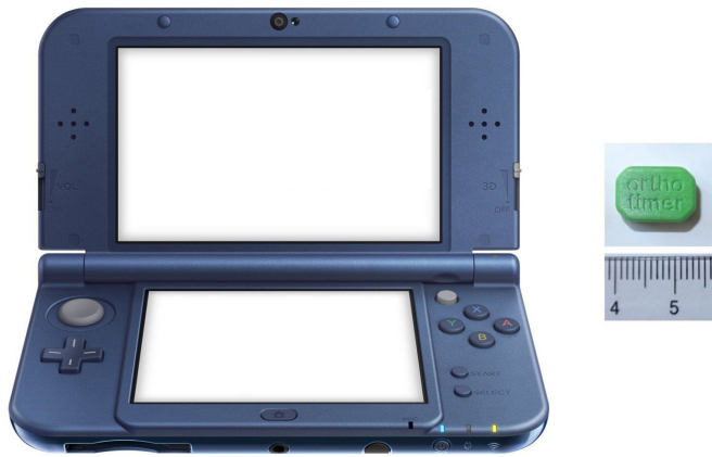
Figure 1 The handheld dichoptic games console used to administer the balanced binocular viewing treatment (left) and temperature sensor/logger with centimetre scale used as occlusion dose monitor for patching treatments (right).