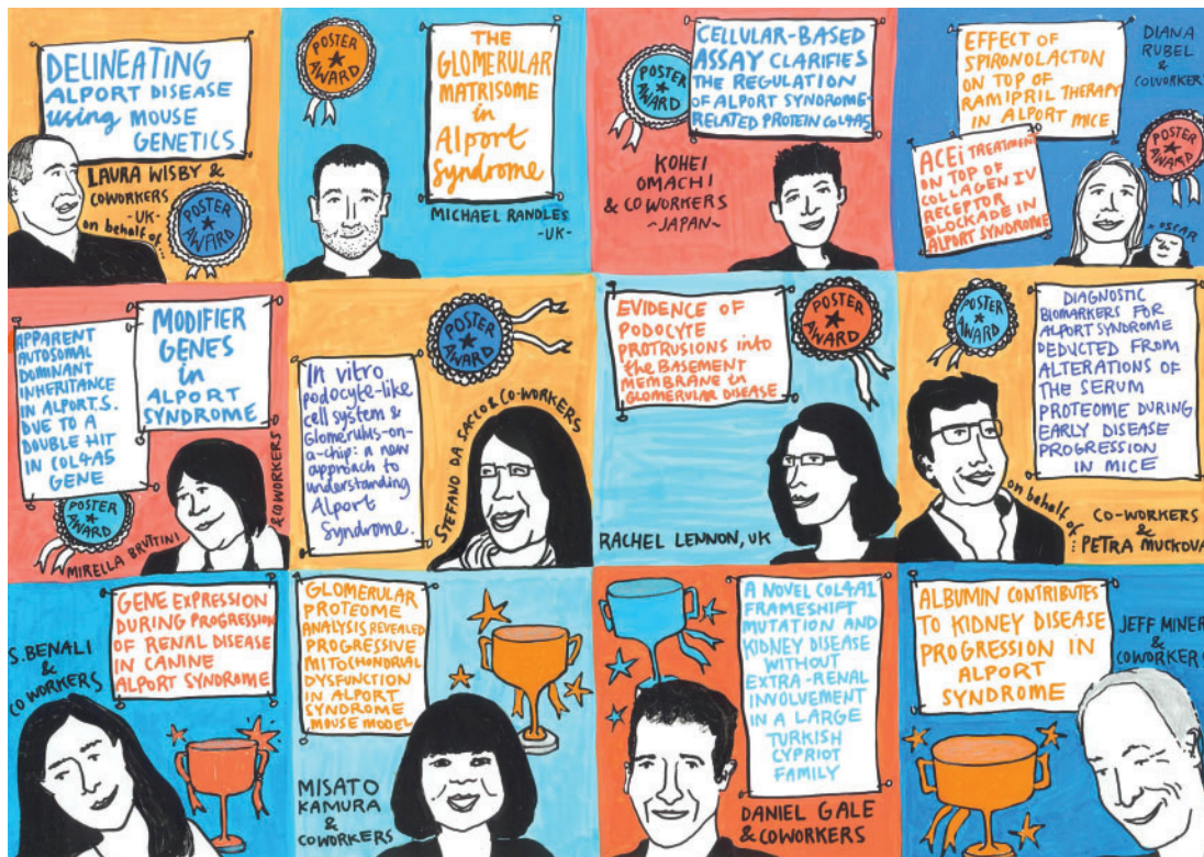
FIGURE 2: Poster prizes and young investigator awards of the 2015 International Workshop on Alport Syndrome.