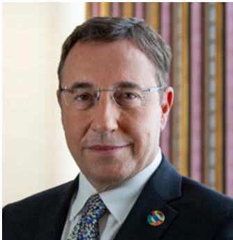
Achim Steiner UNDP Administrator