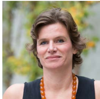
Mariana Mazzucato Professor and Founding Director, Institute for Innovation and Public Purpose, University College London

More than one year into the COVID-19 pandemic crisis, we are still far from grasping its long-term implications for the developing world, which are likely to be far-reaching and wipe out decades of progress on fighting poverty and gender inequality. As the global crisis continues, it triggers new issues such as vaccine inequity and escalating debt, presenting governments with an ever-growing list of interconnected challenges. It is still too early, therefore, to draw definitive lessons on the most effective responses to the pandemic.