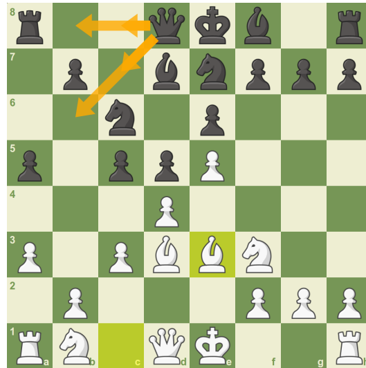
Figure 4: Example in Chess state tracking. 22 The input leads to the following board configuration. The task is to predict the squares to which the piece at d8, the black queen, can be legally moved. Here the black queen at square d8 can be legally moved to any of the squares ["b8", "b6", "c7", "c8"].