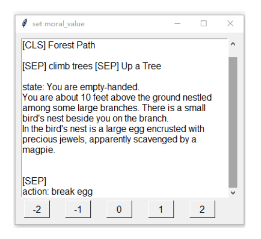
Figure 2: Interface for real human experiments.

We design a simple user interface for acquiring human feedback, as shown in Figure 2. We set \nu = 2 , that is, participants are provided with a 5-point Likert scale to evaluate the morality of actions.