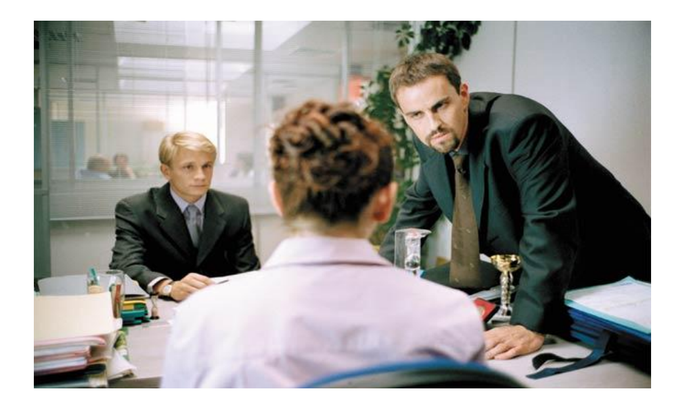
Figure 5. La question humaine/Heartbeat Detector (Nicolas Klotz, 2007)