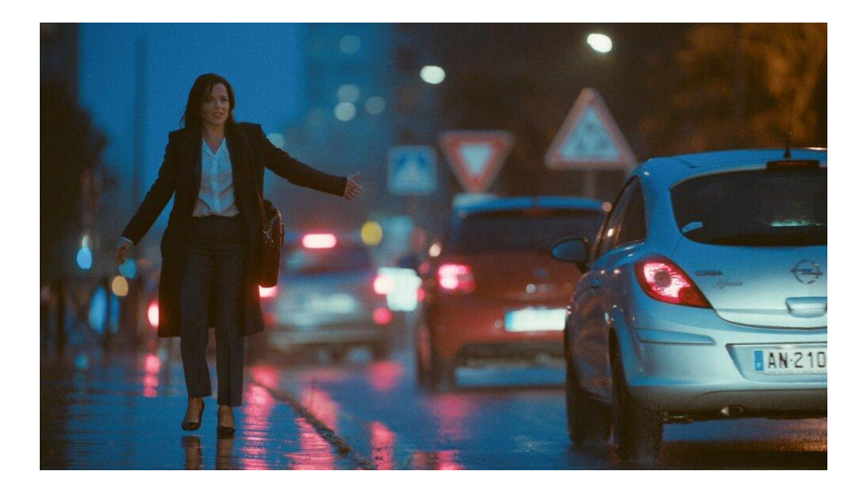
Figure 11. Crash Test Aglaé (Eric Gravel, 2017)