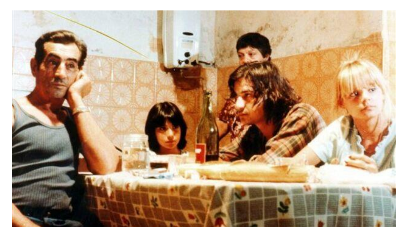
Figure 2. L'emploi du temps/Time Out (Laurent Cantet, 2001)

Figure 1. Dernier été/Last Summer (Robert Guédiguian, 1981)