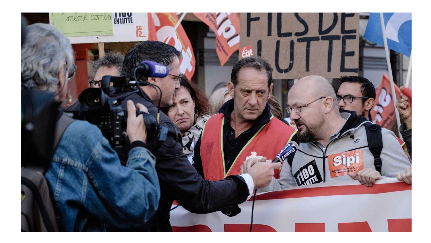
Figure 9. En guerre/At War (Stéphane Brizé, 2018)