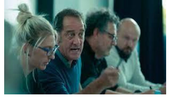
Figure 10. A Plein Temps/Full Time (Eric Gravel, 2021)