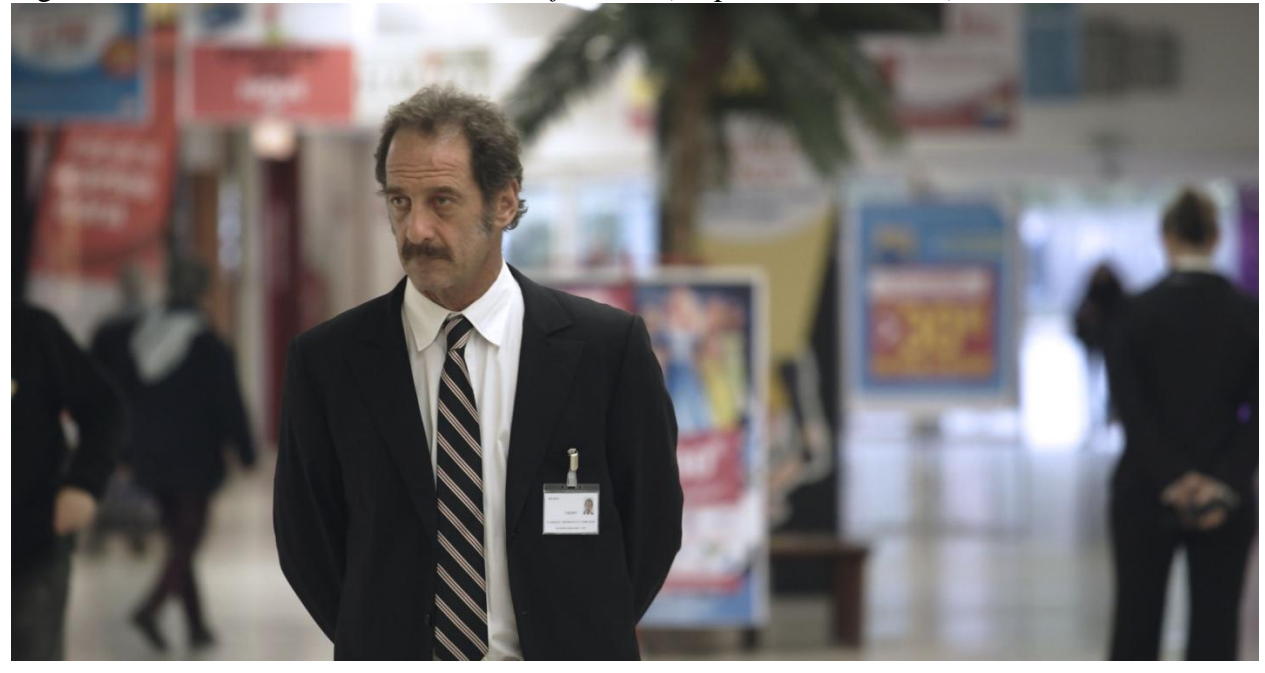
Figure 8. En guerre/At War (Stéphane Brizé, 2018)