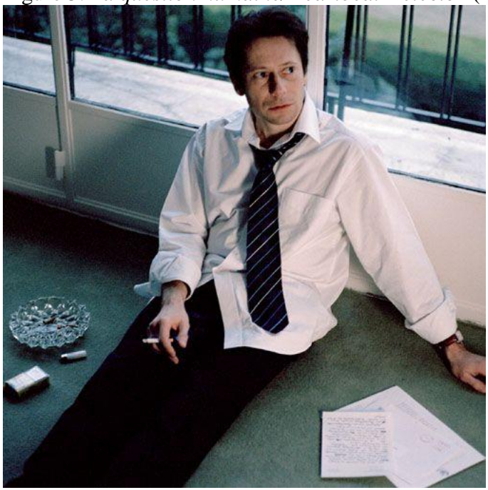
Figure 6. De bon matin/Early One Morning (Jean-Marc Moutot, 2011)