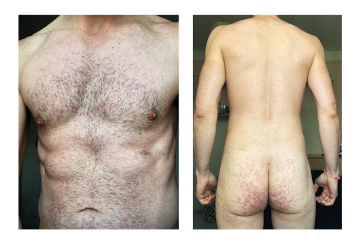
Fig 6 | Symmetrical maculopapular rash of the torso, back, and buttocks. Also see supplementary figure 6