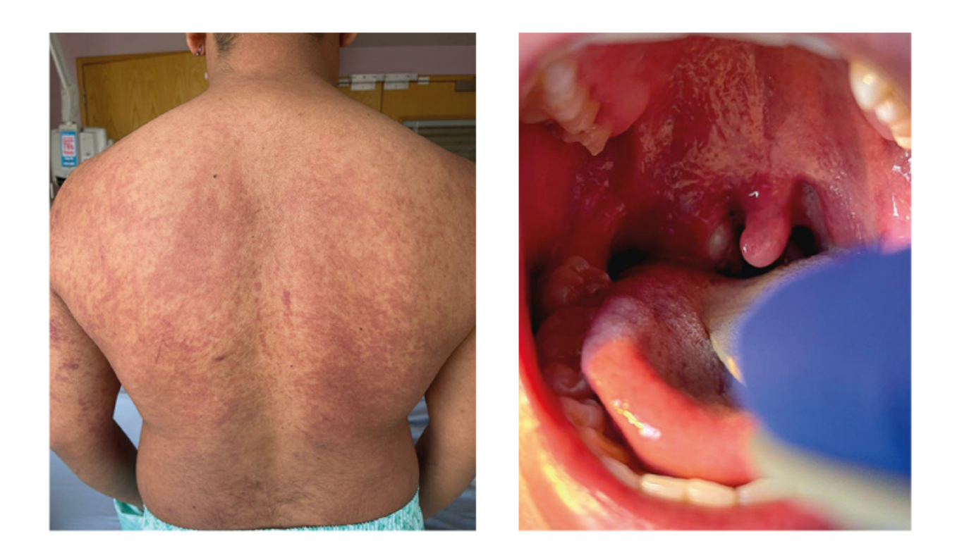
Fig 7 | (Left) Symmetrical erythematous maculopapular rash on back and upper arms, with areas of confluent erythema. (Right) Right tonsillar enlargement with an overlying pustular lesion and yellow-green exudate with slight deviation of the uvula

Fig 6 | Symmetrical maculopapular rash of the torso, back, and buttocks. Also see supplementary figure 6