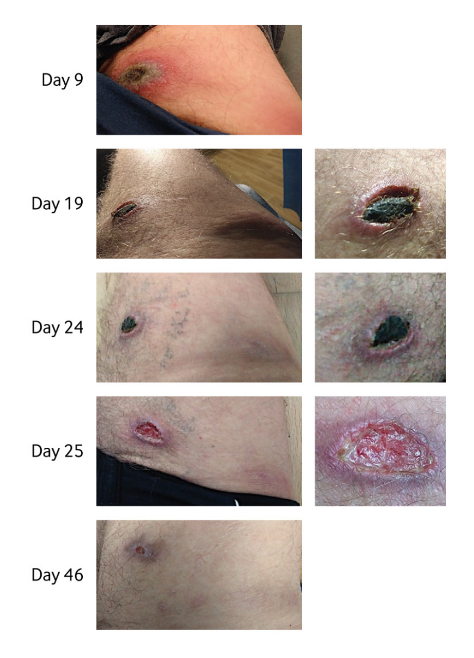
Fig 4 | Development of solitary lesion on right upper inner thigh, tracking laterally to outer thigh. Also see supplementary figure 5