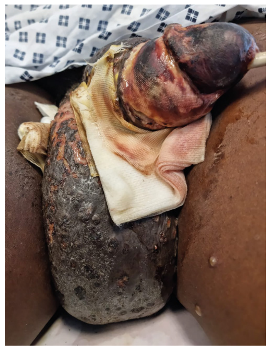
Fig 2 | Secondary bacterial infection of penis due to Staphylococcus aureus and Streptococcus dysgalactiae. Also see supplementary figure 4