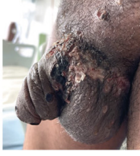
Day 11 (admission)