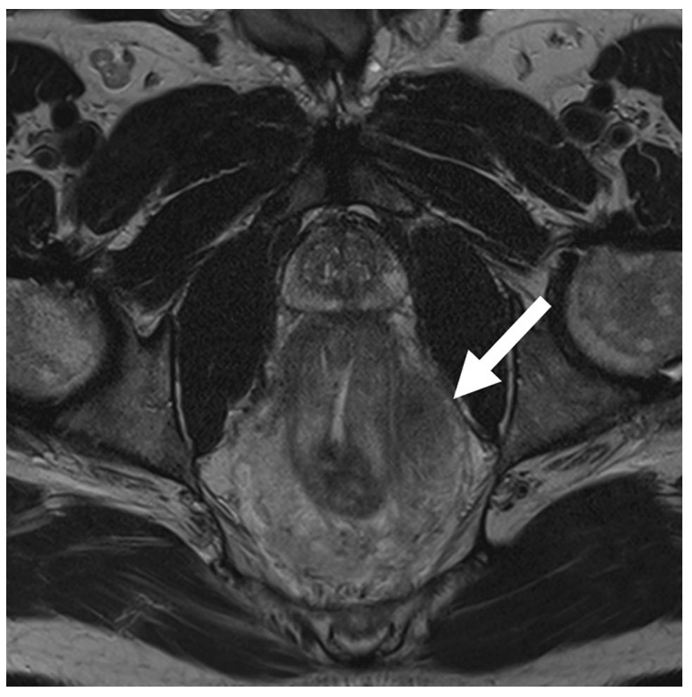
Fig 3 | T2 weighted magnetic resonance imaging scan of pelvis showing a 3.5 cm cavity in left mesorectum, adjacent to the rectal wall representing an area of localised perforation (arrow)