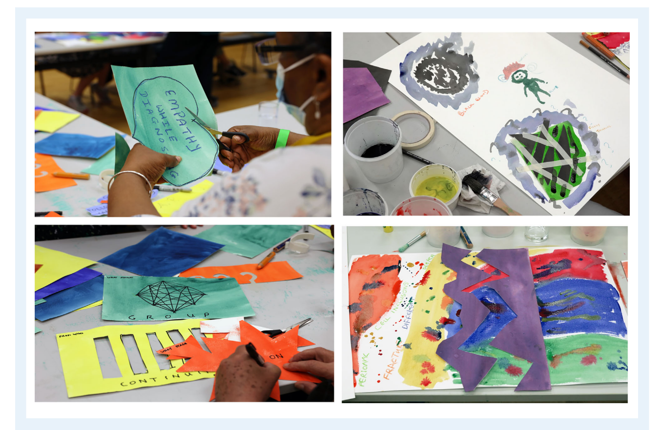
Figure 1. Outputs from the creative workshops that informed the content of information resources.

We held a series of focus groups with workshop participants, to refine and review the information resources, which had been developed using creative outputs and discussions during the workshops. Two groups of participants, remaining in the same groups as the workshops, each took part in three focus groups. The groups were: PD without dementia (total n = 6; comprising