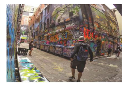
c) Custom collection Dash Cam GoPro Mobile Phone

b) Crowdsourced photo Mapillary Flickr Instagram