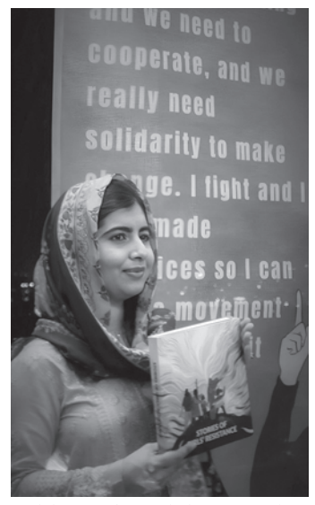
Malala Yousafzai with the Stories of Girls Resistance book at the Women Deliver conference, Kigali, Rwanda, July 2023.

'And yet through history their stories have been erased, co-opted and ignored. Too often girls are positioned as passive victims in need of saving or as heroines standing up against all odds in a